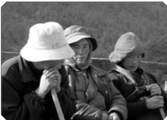
Resting after crossing over the Nanga mountain pass.

During the months of frigid temperatures, the Chinese People's Armed Police (PAP) patrolling the Tibet side of the border are believed to be less active in their patrols. The PAP is responsible for China's internal security, the protection of state installations – including prisons – and is the primary security force patrolling the escape passes. In 2003, the PAP took new measures to increase border security and block access to remote mountain routes. A new prison for Tibetan refugees apprehended by the PAP was fully operational outside the town of Shigatse in 2003. Security on the Nepal side of the border was also enhanced by the presence of army troops, armed police and regular police, working under the “unified command” of the Royal Nepal Army. The Army has been deployed throughout the countryside in recent years to counter the Maoist insurgency and stifle smuggling. In addition, some guides took themselves out of business after the May 31, 2003 refoulement due