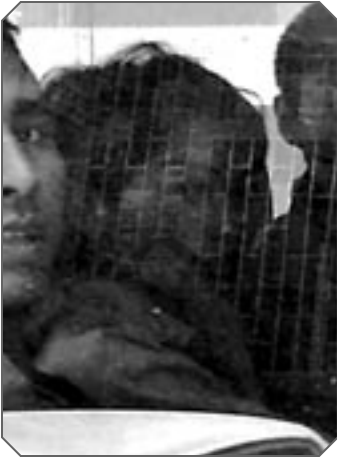
May 31, 2003, 12:24 pm, Kodari, Nepal. This photo was taken through the window of the bus carrying the 18 Tibetans just 100 yards from the Nepal-Chinese Friendship Bridge and Tibet border.

published as to whether or not the inmates actually had the virus, but ICT has received information from one of the four who was quarantined that indicates that SARS was not the cause of their illnesses. 54 After spending eleven days in a prison in Nyalam at the Tibet/Nepal border, where the Tibetans were reportedly beaten and tortured, most of the group was taken to a prison in Shigatse. The four men suspected of carrying SARS remained quarantined in Nyalam.