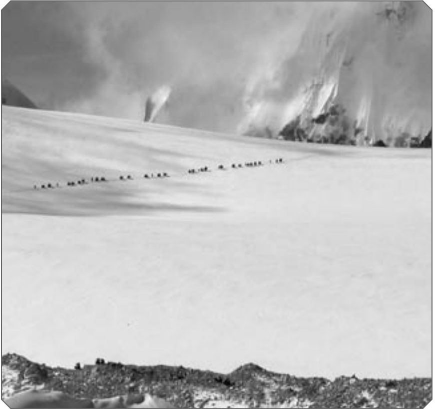
Elevation 19,000 feet. A yak caravan traverses the Nangpa mountain pass from Nepal (west) to Tibet (east). The smooth surface belies the shifting glacial conditions. This photo was taken in September 2003, a day before a 17-year old Tibetan girl fell into a crevasse (just above the left end of the caravan pictured) and was lost after her companions failed in their attempts to pull her out with a rope made from their clothing.

a 25-year-old male Tibetan told ICT in Kathmandu. “We ran back where we came from just trying to avoid the army. After hiding from the gun blasts for many hours, we climbed over Nangpa la in the middle of the night and walked the entire day on the Nepal side as we were so scared.” Only 17 of the 34 successfully made it over the Nangpala. The border police caught the others, and it is not known if any of those who were apprehended had been wounded or killed during the shooting incident.