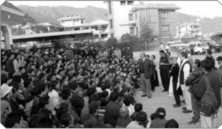
December 2003, Kathmandu, Nepal. ICT-led delegation of U.S. congressional staff are greeted by some 1,000 Tibetan refugees at Tibetan Refugee Transit Center.

problematic for Tibetans. 12 When the Chinese government attacked her findings during the presentation of her report at the U.N. Commission on Human Rights, the Rapporteur characterized the situation of literacy in Tibet as “horrendous.” 13 Tibetan children are taught the national curriculum in the Tibetan language in primary school, but they must be literate in Chinese to access higher educational and economic opportunities. 14 Beyond primary education, Tibetan language is typically an elective class, and all other subjects are taught in Mandarin Chinese. Tibetan children, lacking the Chinese language skills to understand their math and science classes in upper grades, fall behind and lose interest in school. Their poor performance serves to reinforce Chinese stereotypes of Tibetans as stupid and backwards.