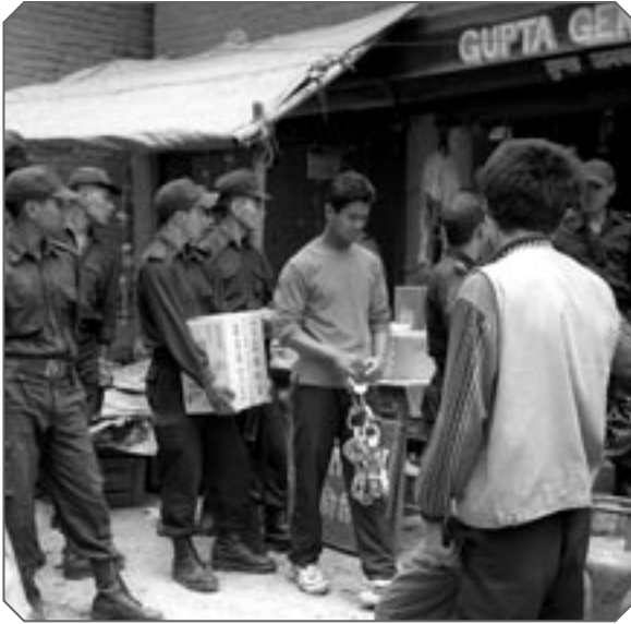
May 31, 2003, 1:30 pm, Kodari, Nepal. Nepalese police return from the Tibet side of the Nepal-China Friendship Bridge after handing over 18 Tibetans to Chinese border security. One is carrying a box labeled Qian Kun (Heaven and Earth), a famous brand of liquor produced in Sichuan province, presumably a gift from Chinese border security.