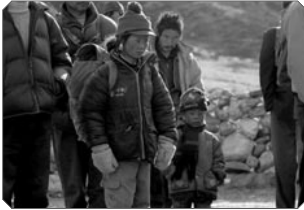
Solo Khumbu area, Nepal. Two young cousins sent out of Tibet by their parents for education in Tibetan refugee schools in India.

influences. In December 2002, a prominent Tibetan lama, Tenzin Delek Rinpoche, was sentenced to death with a two-year suspension for his alleged involvement in a series of small bombings in Sichuan province. The judicial proceedings against him failed to meet minimum standards of due process 16 and China has produced no evidence linking him to any crime. 17 Credible reports indicate that Tenzin Delek's arrest and sentencing were politically motivated, reflecting his influence in the Tibetan community where he had worked for many years to bolster Tibetan institutions, including monasteries and schools, and his loyalty to the Dalai Lama. 18