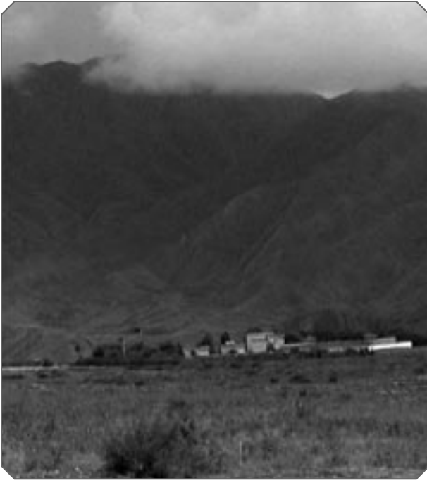
The “Snowland New Reception Center,” a prison in Shigatse for Tibetans caught attempting to flee to or return from India or Nepal.

The prison is set off from residential and commercial areas to the southwest of Shigatse and is across from an area known as Dechen Podrang. Dechen Podrang was the traditional summer residential area for the previous Panchen Lamas and often was used for public religious sermons and blessings.