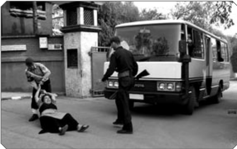
May 31, 2003, 7:40 am, Kathmandu Police Club. A local Tibetan woman throws herself in front of a bus to block the forcible repatriation of 18 Tibetans inside. After Nepalese police drag her away, the bus speeds away.

On April 17, a UNHCR protection officer appealed for the release of the Tibetans into their custody on the usual humanitarian grounds but was refused by the DOI. Later that same day, the DOI issued an administrative ruling against the Tibetans for “illegal entry into the Kingdom of Nepal.” After a further appeal, three young children, ages six and nine, were turned over to the UNHCR. The other 18, including ten teenagers, were given heavy fines and default prison sentences of seven to ten months. Among those who remained in Nepalese custody was the father of one