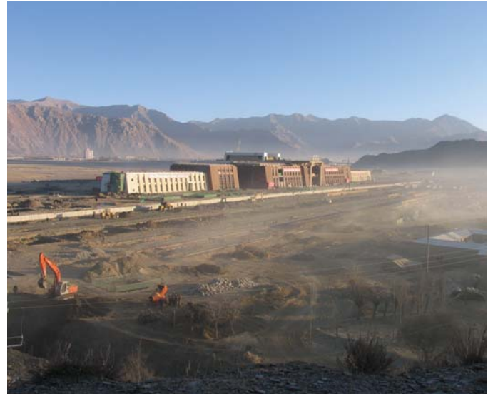
Lhasa railway station under construction in winter 2006.