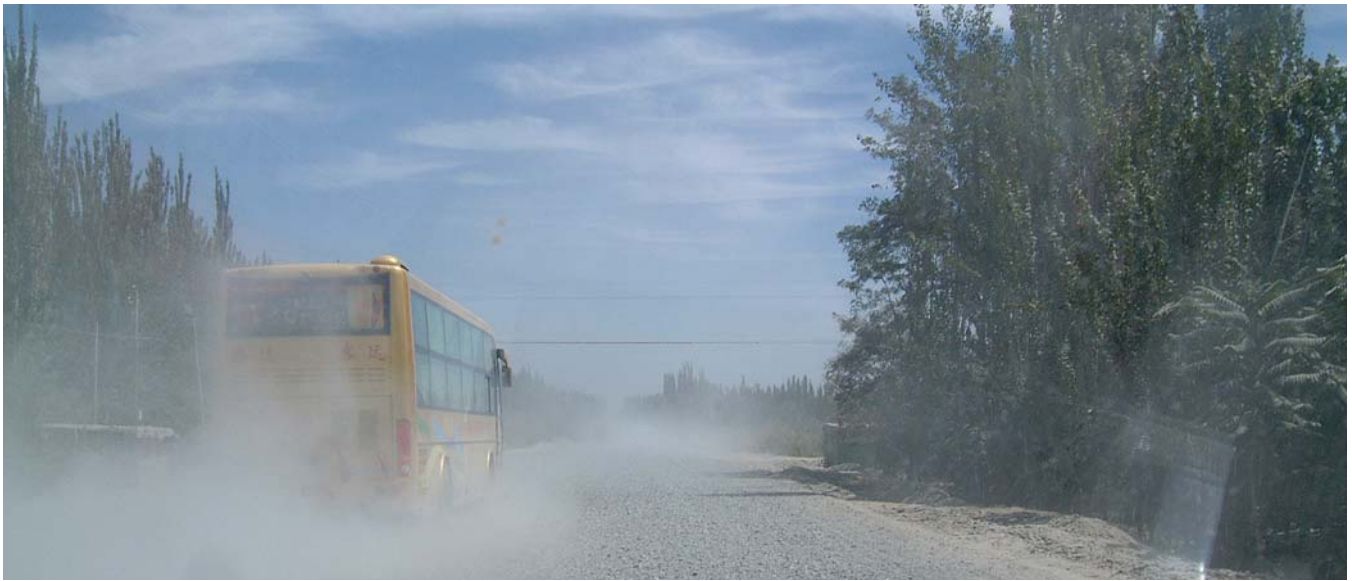
Bus bringing Chinese immigrants to Xinjiang on new roads - four to six lane highways replacing dirt tracks - on the southern Silk Route.

Unlike Alaska or Siberia, where freezing temperatures keep permafrost well below the thawing point, the subsoil on the Tibetan plateau can best be described as barely permanent permafrost. When it thaws, the ground can drop by as much as a foot, and can heave up again the next time it freezes. In order to build the railway on such terrain, Chinese scientists had to predict the rate of climate change, and then design a system that would keep the ground frozen and the train's foundation stable even if the air warms. In some areas an elevated track has been built, allowing cold air to flow beneath the track and cool the ground. In other areas, sections of the railway are lined with vertical pipes that circulate liquid nitrogen, or ventilation tunnels have been built below the tracks.