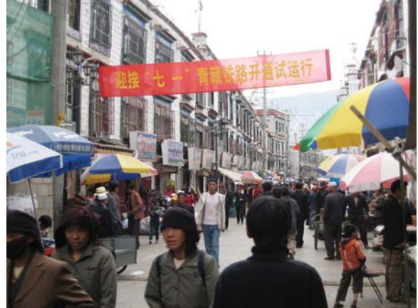
A poster stating 'Welcome to the July 1st Test Run of the Qinghai-Tibet Railway' in large Chinese characters in one of Lhasa's old streets leading to the ancient Ramoche monastery. Although both Tibetan and Chinese are the official languages in the TAR, during the railroad construction mostly the Chinese language has been used on prominent billboards, with Tibetan used either in small characters or not at all.

This reflects the pattern of employment on a railway which has been constructed by Chinese companies. Most workers are Chinese, with some unskilled work going to Tibetans. 5 Tibetans face increasing competition for employment and marginalisation within their own communities due to the numbers of Chinese migrants entering Tibet, including those employed on the railroad, and others who will be attracted by the greater accessibility of Tibet via the railroad.