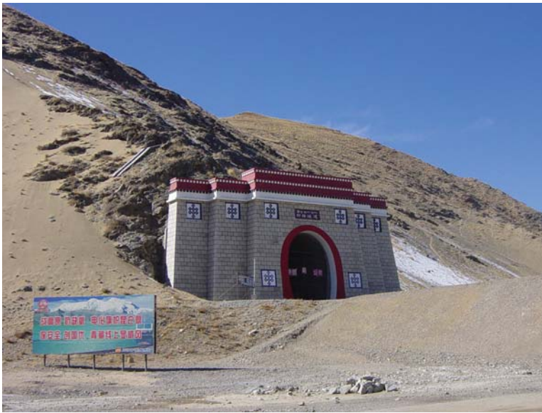
Ne'u county tunnel (Tibetan: sNe'u rdzong brag phug; Chinese: Liuwu suidao) at 620 m. In typical official language, the billboard states: "Fight the plateau and resist the lack of oxygen. The flag of electrification shakes the Kunlun mountains. Safeguard security and create national excellence. Prestige is displayed on the Qinghai-Tibet Line - China Railways Electrification Bureau Group".

in the region: "National interest in the railroad derives at least in part from its strategic military value, and the construction and eventual maintenance of the railway also contribute to the perceived need for increased military presence in order to protect the new installations. Therefore, as in the past, military concerns probably guide much of the developmental policies in the TAR, indirectly soaking up much of the subsidies as well." 12