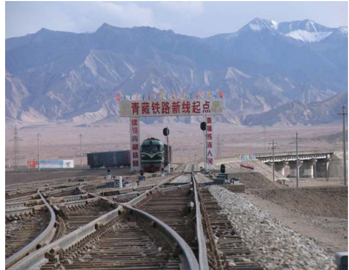
Train at Golmud at the beginning of the Golmud-Lhasa railway. Sign reads: “A new starting point of the Qinghai-Tibet Railway. Build the Qinghai-Tibet Railway to benefit peoples of all ethnicities”.

Fischer says: “Like other industries in the TAR, much if not most of the tourist industry (particularly in the higher-value areas) is controlled by Chinese companies based outside the TAR. Similarly, tenders for most or all of the large construction projects in the TAR are contracted to out-of-province companies - the Qinghai-Tibet railway involves a consortium of state-owned