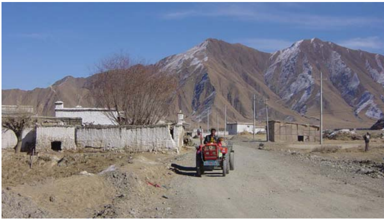
The traditional Tibetan township of Ne'u, prior to development as a 'high-tech' center and the site of the new Lhasa train station