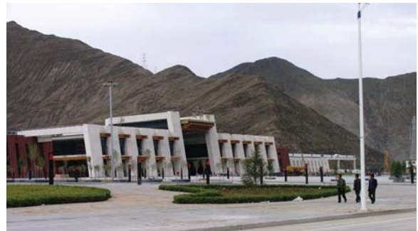
The facade of the Lhasa railway station. The station is a large brick-red and white structure that is intended to echo the architecture of the Potala Palace, the Dalai Lama’s former winter home. Many Tibetans in Lhasa are angered by the appropriation of one of their most important religious and cultural symbols in this way.

Official statements have emphasized the need to develop the Western regions of China, including Tibet, in order to “promote unity” and “ensure stability”, meaning to maintain control over the region.