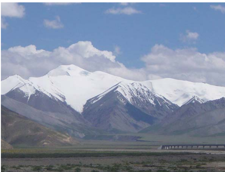
The Qinghai-Tibet Railway reaches elevations over 16,000 feet. Chinese scientists suggest that global warming may start to melt the permafrost within 10 years, endangering the $4.1 billion rail line.