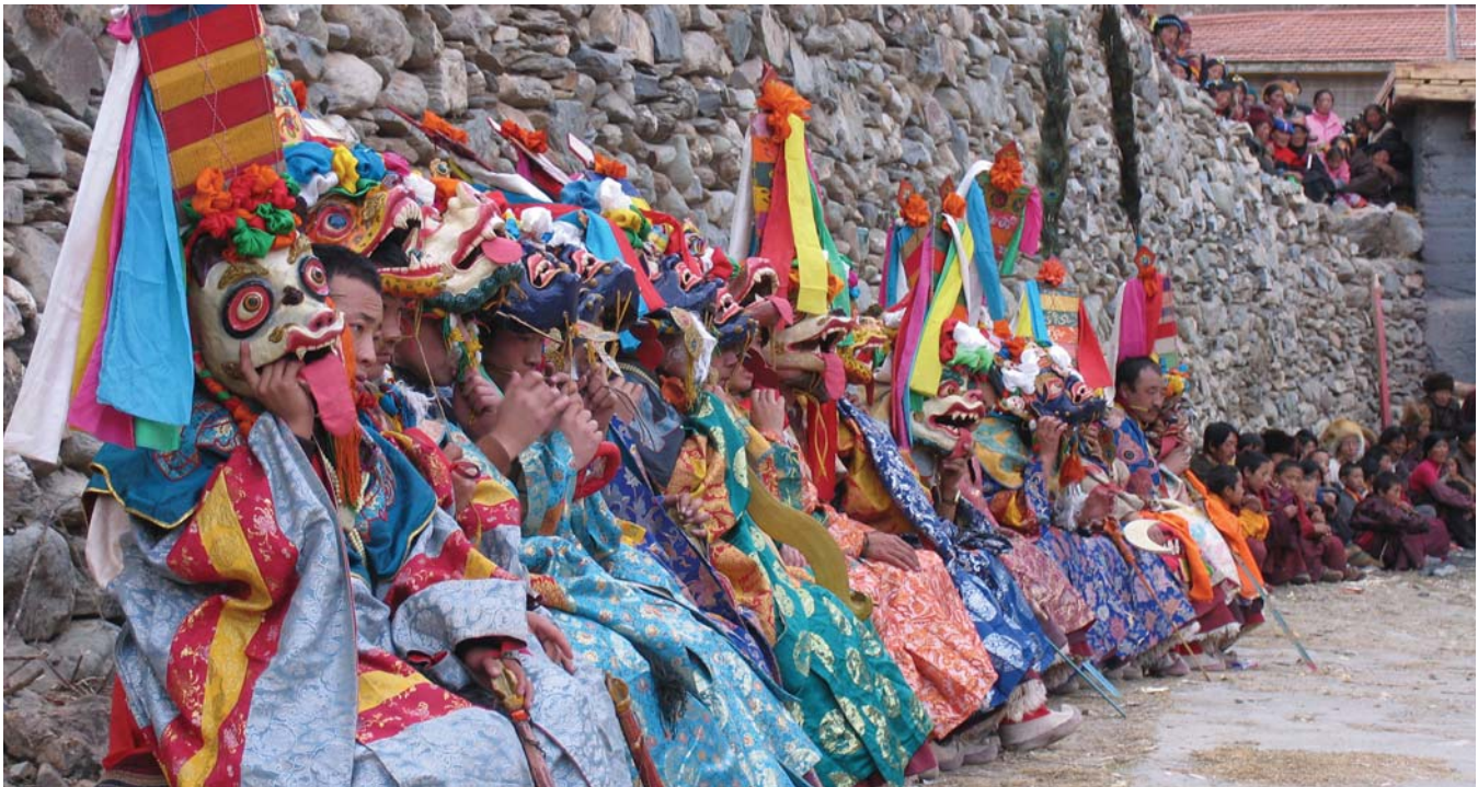
Cham dancers rest during a performance at a monastery in Kardze (Chinese: Ganzi), Sichuan (the Tibetan area of Kham) during a celebration of Tibetan Buddhist protector deities at the monastery in winter 2005.