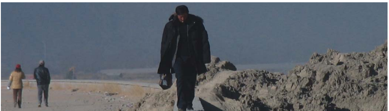
A Tibetan worker early on in the laying of tracks. Most workers on the railroad have been Chinese, with Tibetans doing largely unskilled manual labor.

This report is accompanied by new images of the development of Lhasa and the construction of the railway, demonstrating its impact on the Tibetan landscape and people. The Qinghai-Tibet railway is the most visible and costly element of China's "Great Leap West" (Chinese: xibu da kaifa), 4 a high-profile political campaign, initiated by the then Party Secretary and President Jiang Zemin in 1999-2000. This drive to develop the Western regions of the territory claimed by the People's Republic of China affects 56% of China's land area and almost a quarter of China's population, including Tibetans, Uighur Muslims and other "national minorities".