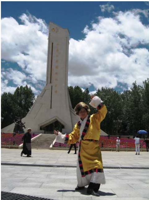
Chinese workers came from all over China to work at the site of the railway station in Lhasa. The picture depicts a Chinese worker who has been working at the Lhasa railway station for the past five months posing in Tibetan dress for a souvenir photo in front of the monument 'Tribute to the Peaceful Liberation of Tibet' which dominates the Potala Square.

education" campaign, as he said the Party is engaged in a "fight to the death struggle" against the Dalai Lama and his supporters. 2 Zhang, who was formally appointed as TAR Party Secretary on May 26 from a senior post overseeing the immigration of Chinese into ethnic Uyghur areas in Xinjiang (East Turkestan), described the Dalai Lama as "the biggest obstacle hindering Tibetan Buddhism from establishing normal order".