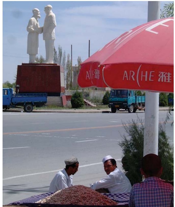
A statue of Mao Zedong in Xinjiang, intended to convey the message of China's help to the Uyghur people. New statues of Mao are being built throughout the region. Similarly, a 35-ton statue of Mao - the biggest in China - has been built in Gonggar county, near the airport and en route to Lhasa, in Tibet. The statue will rise 7m from a 5m pedestal strengthened to withstand earthquakes. Mao Zedong ordered the Chinese takeover of Tibet in 1949-1950.

The extension of the railway line from the provincial capital of Xinjiang, Urumqi, to Kashgar sets a disturbing precedent for the railroad from Golmud to Lhasa. It has transformed the desert oasis town and led to increasing despair among many of the indigenous Uyghur Muslim population. The rail link opened in autumn 1999 for the transportation of goods, and passengers began to travel on the railway in 2000, during the period when the TAR's current Party Secretary Zhang Qingli held a senior role in the province. The 1,000 km journey from Urumqi to Kashgar takes about 24 hours.