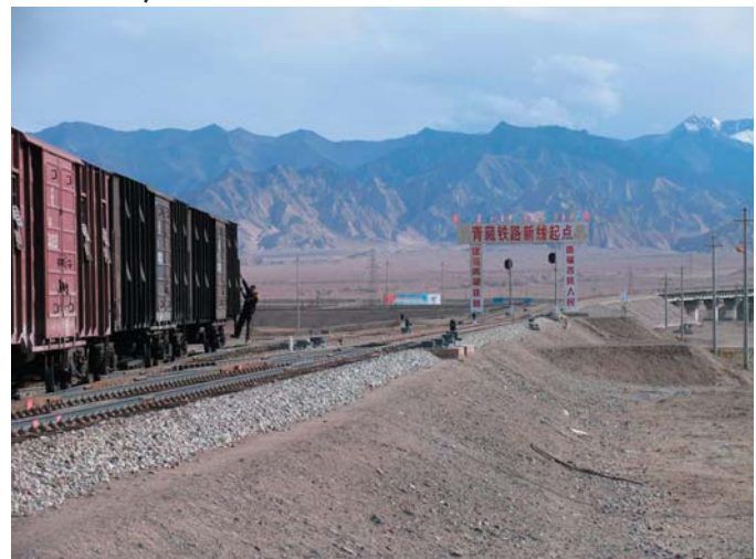
New trains at the terminus at Golmud, Qinghai.