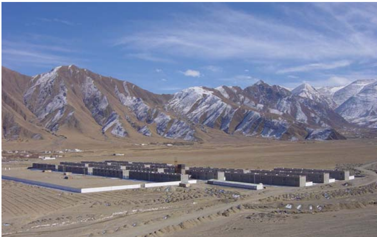
An image of the new buildings in the Ne'u area. The expanse of land around the new construction appears to call into question the need for resettlement