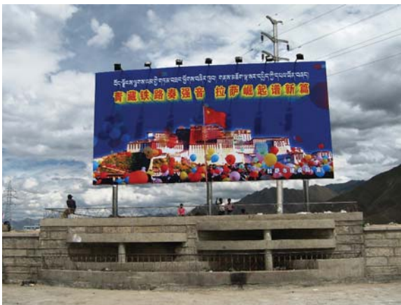
A billboard in Lhasa near the Kyichu River bearing the slogan both in Chinese and Tibetan: 'Disseminate the good news about the Qinghai-Tibet railway and Lhasa will spring anew'.

Chinese census in 2000, Tibetans currently have the highest rate of illiteracy of any major ethnic group in China. 6 Primary school is the only level of educational attainment for which data show Tibetans nearly on par with the national average. There are disparities in the level of educational attainment between urban and rural Tibetans - Tibetans living in towns or cities are more likely to reach higher levels of educational attainment. Approximately 85% of Tibetans living in the TAR live in rural areas, and this is the most disadvantaged group in terms of facing competition for employment.