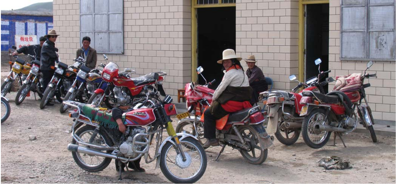
Nomads on motor-bikes in eastern Tibet (Qinghai). Under Chinese policies of urbanization, more and more Tibetan nomads are required to settle in towns.

shoe-making, watch or tape-recorder repairing...etc. They came in small numbers and worked individually. Since the late 1980s, temporary migrants came in the forms of construction teams, vegetable gardeners, and restaurateurs. Their numbers increased rapidly since 2000 when the central government launched the national strategy of 'Developing the West' following the huge amount of investment and construction projects in the TAR and other regions in the west of China...In future, the temporary migrants in Lhasa are expected to grow, partly due to the numbers of the Tibetan rural population who will gradually join the migration flow, and partly due to the completion of the Qinghai-Tibet railway which will provide a much more convenient transportation to link Lhasa and other cities in nearby provinces." 19