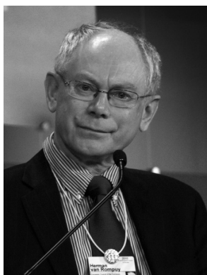
Herman Van Rompuy

Asia-Pacific News - May 17, 2011 European Council President Herman Van Rompuy on Tuesday urged China to bolster its international image by upholding human rights and the rule of law.