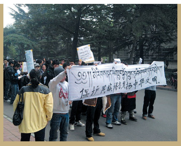
Students from the Central University for Nationalities in Beijing demonstrate for the preservation of Tibetan language.