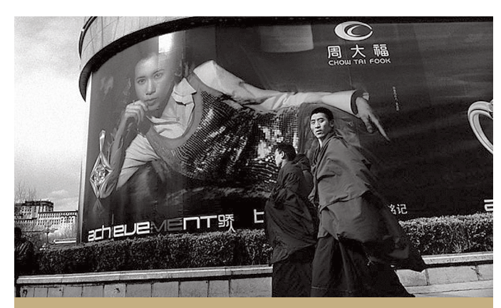
Monks pass by a billboard outside one of the new Chinese shopping malls in Lhasa near the revered Tibetan Potala palace.

Scientists say the desertification of the mountain grasslands is accelerating climate change. Without its thatch the roof of the world is less able to absorb moisture and more likely to radiate heat. Partly because of this the Tibetan mountains have warmed two to three times faster than the global average; the permafrost and glaciers of the "Third Pole" are melting.