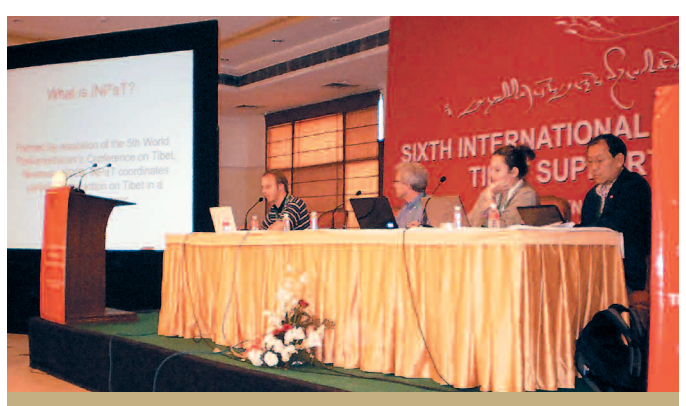
ICT staff participate in the Sixth International Conference of Tibet Support Groups in India in November.

The Sixth International Conference of Tibet Support Groups was held at Surajkund in the north Indian state of Haryana from 5 to 7 November 2010. It was convened by the Core Group for Tibetan Cause — India, the apex coordinating body of the Tibet supporters in India, and facilitated by the Department of Information & International Relations of the Central Tibetan Administration.