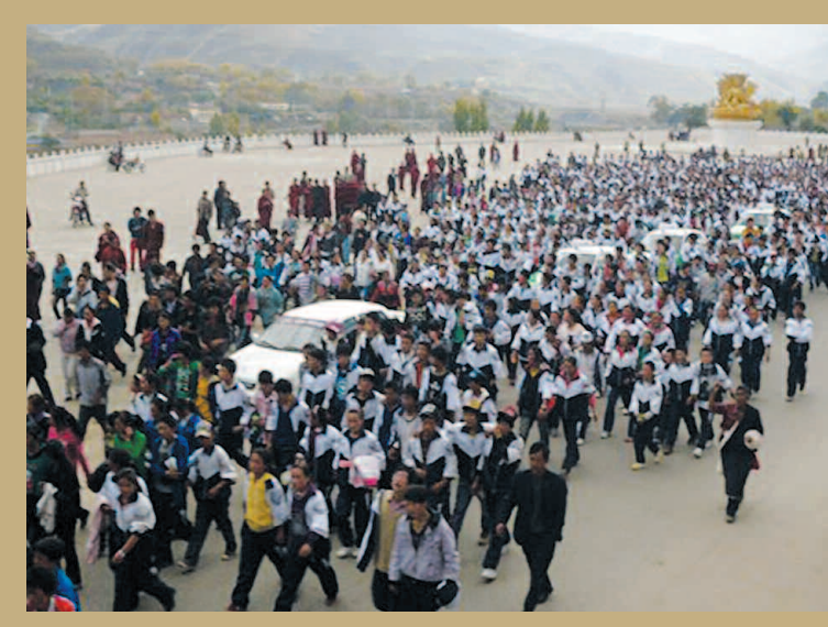
The first protest to China's announcement occurred in Rebkong Prefecture October 19.