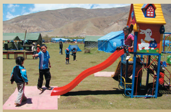
Children play at temporary kindergarten set up in Yushu after the earthquake.

You can download a free copy of this remarkable report in its entirety at savetibet.org/media-center/ict-news-reports.