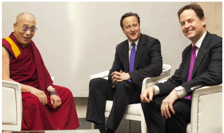
UK Prime Minister David Cameron and his Deputy Nick Clegg with His Holiness the Dalai Lama.

On 14 May 2012, the Dalai Lama met British Prime Minister David Cameron and his deputy in the ruling coalition, Nick Clegg. In response to the stormy reaction from Beijing to the meeting, the British government said that it was up to the Prime Minister and Deputy Prime Minister to choose with whom they meet.