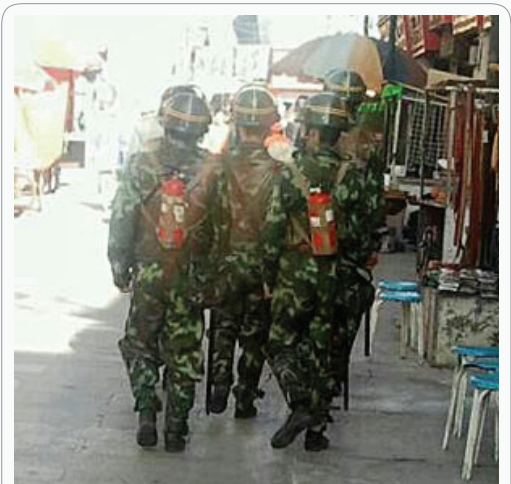
People's Armed Police carrying fire-extinguishers in Lhasa