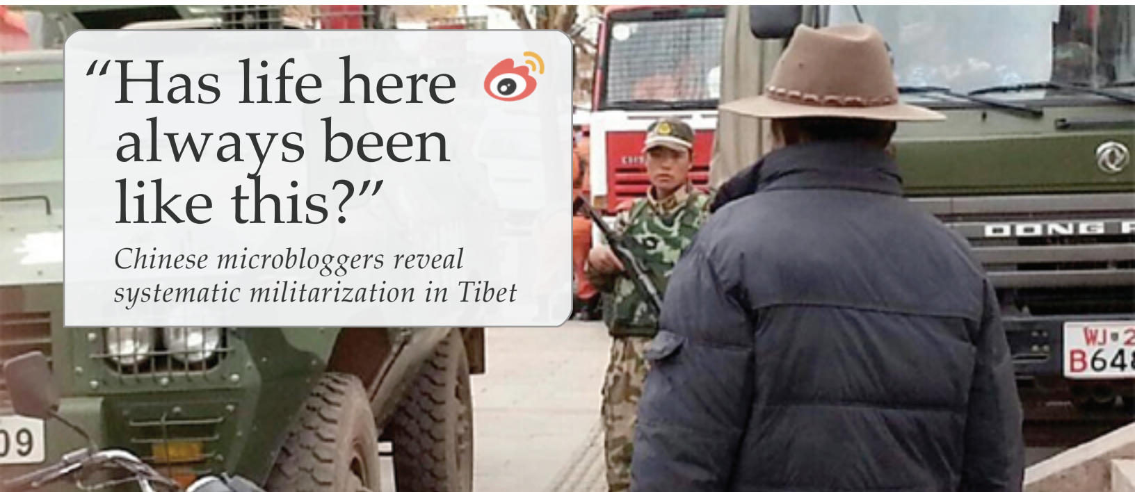
Photo posted by Chinese tourist on Weibo social media site, taken in the town square, Chamdo, Tibet Autonomous Region, in early spring, 2013.

Chinese microbloggers reveal systematic militarization in Tibet