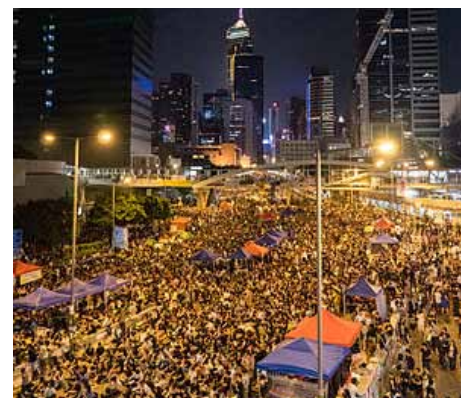
Demonstrators in Hong Kong

in Hong Kong and on the mainland, or it strengthens its authoritarian grip. This would fuel aggressive nationalism, leading China along the wrong path in the future while sending a bleak message to the international community. ■