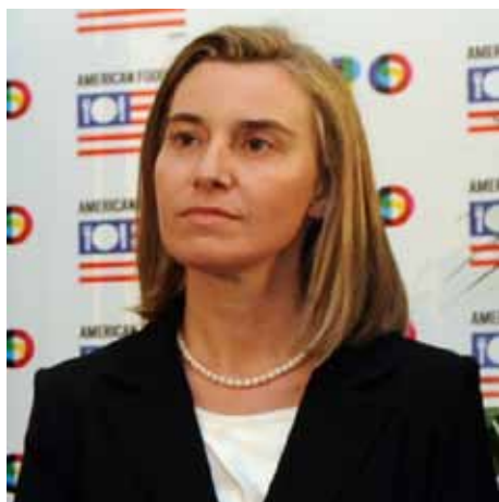
Federica Mogherini, EU High Representative for Foreign Affairs and Security Policy

The International Campaign for Tibet (ICT) welcomes the investiture of Mrs. Federica Mogherini as the new High Representative of the European Union for Foreign Affairs and Security Policy and Vice-President of the European Commission. It looks forward to her continued interest in the issue of Tibet.