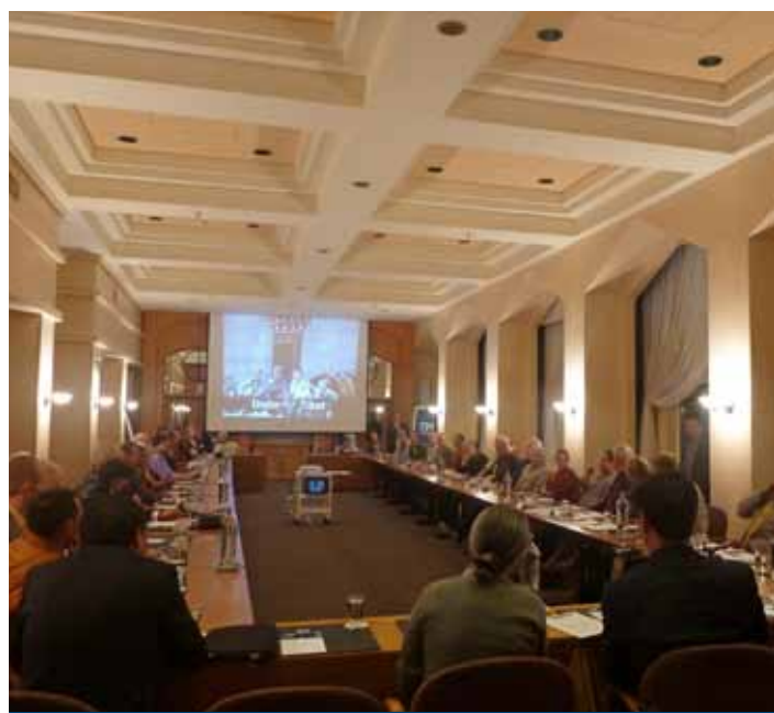
Meeting between Dr. Sangay and Dutch Tibet-related organisations in Amsterdam, October 2014.

The Tibetan political leader, Sikyong Dr. Lobsang Sangay , visited several EU Member States during the month of October. He met with officials in the Czech Republic, Belgium, the Netherlands and Spain.