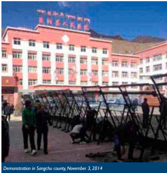
Demonstration in Sangchu county, November 3, 2014

from the authorities. According to sources and reports in exile Tibetan media, land had been acquired from the same area by the local authorities at different times for different rates; the protestors sought a uniform and fair rate of payment for the land.