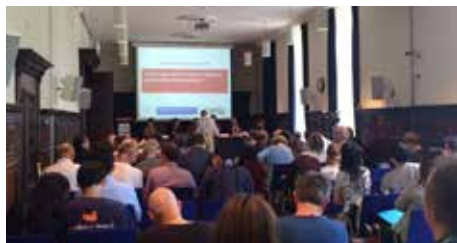
Around 80 people attended the event, including diplomats, representatives from NGOs, Chinese dissidents, representatives of the Tibetan and the Uyghur communities, academics and journalists.

provisions of the law curtailing the rights of groups such as Tibetan and Uyghurs, and