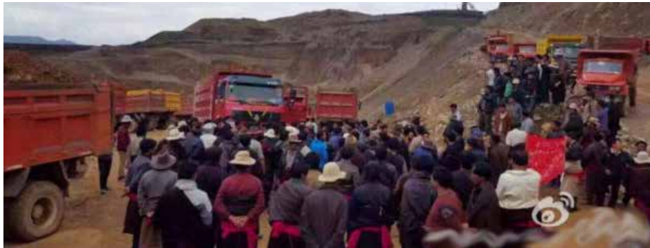
Tibetan protestors and mining equipment at Gong-ngon Lari

Following days of peaceful protests against an enormous open-air mining project, armed Chinese police beat and detained a number of Tibetan demonstrators in the Amchok region of northern Tibet.