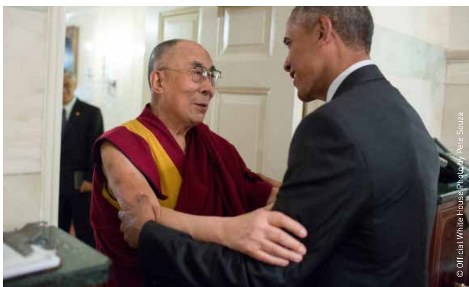
President Barack Obama greets His Holiness the Dalai Lama at the entrance of the Map Room of the White House, 15 June 2016.

The Dalai Lama visited Washington D.C between 12-16 June during which he met with President Barack Obama, House Speaker Paul Ryan, Democratic Leader Nancy Pelosi, the Senate Foreign Relations Committee, and a bipartisan group of members of the House of Representatives and the Senate.