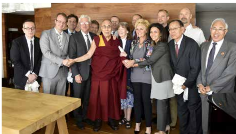
His Holiness the Dalai Lama with ICT's Board Chairman Richard Gere, ICT Board Members and Senior staff in Washington D.C on 14 June.

In its official readout of the President's Meeting with His Holiness the XIV Dalai Lama (the fourth one during his two-term presidency), the White House stated: "The President and the Dalai Lama discussed the situation for Tibetans in the People's Republic of China, and the President emphasized his strong support for the preservation of Tibet's unique religious, cultural, and linguistic traditions and the equal protection of human rights of Tibetans in China". According to the readout, the President also "welcomed the Dalai Lama's leadership on climate change issues, and expressed support for the Dalai Lama's efforts to raise awareness of the importance of limiting global warming, including to protect the