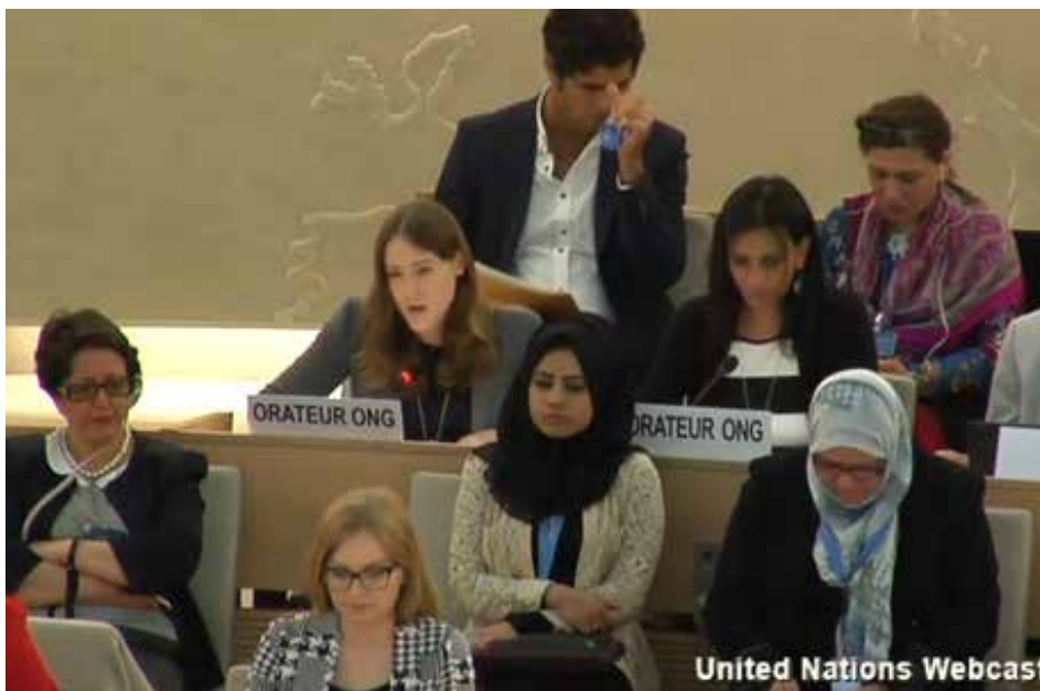
United Nations Webcast

At the 32 nd session of the United Nations Human Rights Council in Geneva, the International Campaign for Tibet once again highlighted issues pertaining to China's repressive policies in Tibet.