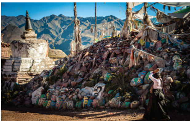
The UNESCO mission noted many cultural and sacred sites in the Hoh Xil area. The nomadic tradition of one of the richest spiritual cultures in the world must be respected and indeed honoured – Tibetans have preserved the natural and cultural heritage of their homeland to a degree that allows it to be considered as World Heritage in the first place. This image depicts a Tibetan on the plateau praying at a typical stupa with mani stones inscribed with mantras.

This special report outlines the implications of China's bid for UNESCO World Heritage status, showing how it is inconsistent with UNESCO guidelines on the involvement of local and indigenous people with decision-making on heritage and land use, in the context of the significant and emerging trend of China's creation of nature reserves across Tibet.