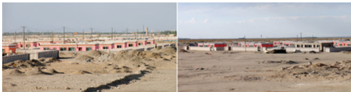
These images show featureless lines of nomad settlement dwellings in the Golmud area of Qinghai, built after the railway was extended from Golmud to Lhasa. Many nomads were removed from their land to be settled here.

The ethos of the policy of settling nomads is to create conditions that will encourage poor rural workers to towns or cities, where they will apparently become workers and consumers in a new, ‘modern’, economy and where the authorities have greater administrative control over people’s movements and lifestyles. Resettlement policies are generally implemented without consultation or consent, and local people have no right to challenge them or refuse to participate. The distinction between coercion and consent to nomad settlement is meaningless in the political climate in Tibet today. This is despite the fact that Chinese law requires that those who are to be moved off their land or are to have their property confiscated must be consulted, and, if they are moved, compensated for their losses. [19]