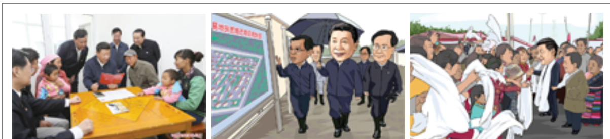
This picture from Chinese official media portrayed Xi Jinping with villagers in Qinghai. The headline to this cartoon in the official media read ‘Walking in the rain shows concern for locals’. China Daily even published a cartoon version of Xi Jinping’s Qinghai tour.

During his visit to Qinghai, Xi Jinping reiterated the official line about removing pastoralists from the grasslands, despite the scientific consensus among rangelands experts in the PRC and internationally that the indigenous knowledge of pastoralists and herd mobility are crucial to the protection of the environment. His visit was indicative of the high priority accorded by the Party state to Tibet, which is the context for the UNESCO application.