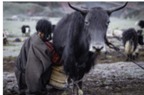
Tibetan pastoralists have made skillful use of the dry landscape of the Tibetan plateau for centuries, co-existing peacefully with wildlife and protecting the land. The involvement of Tibetans – and nomads in particular – as stewards is essential to sustaining the long-term health of the ecosystems, and the water resources that China and Asia depend upon.