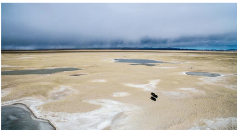
The Chinese state media posted photographs online showing the emptiness of some of the high altitude dry landscape of Hoh Xil.

In a new development, it was announced in the state media last month that the Chinese government is considering turning vast areas of the Tibetan plateau into national parks. According to a report in China Daily on May 11, the Tibet Autonomous Region plans to upgrade the natural reserve around the region’s largest lake of Siling in Nagchu (Chinese: Nagqu or Naqu) and expand it to surrounding areas to establish the World’s Third Pole National Park on the Qinghai-Tibet Plateau. The World’s Third Pole National Park would be established within Pelgon (Chinese: Baingoin), Shentsa (Chinese: Xainza), Nyima (Chinese: Nima) and Tsonyi (Chinese: Shuanghu district) counties in northern Nagchu, covering an area of 281,150 square kilometres. China Daily confirmed the aim to displace people in the area when it stated that the park would be established “in the future after human interference is eliminated and the wild animal population increases.”