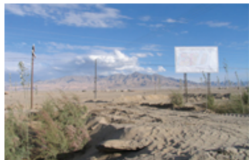
The site of the settlement in Golmud, Qinghai before its construction.

Scholarly papers by Chinese academics have reflected these concerns. In one paper, several Chinese scholars conclude that there had been "extreme economic and environmental impacts" in Jiuzhaigou in recent years, with the fast increasing tourist numbers causing "many changes in the local environment, including: increasing algae in water, increasing nutrients in water, increasing sediment in lakes, degrading travertine, and increasing threat on biodiversity." The paper, published in 2013, concludes that: "Environmental degradation continues to develop as the number of tourists is not controlled. The sustainability issue in Jiuzhaigou is mired in the conflict between the conservation of the natural beauty and local economic development. To promote sustainable tourism, the number of tourists must be controlled." [50]