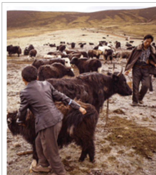
Tibetan pastoralists have made skillful use of the dry landscape of the Tibetan plateau for centuries, co-existing peacefully with wildlife and protecting the land. The involvement of Tibetans – and nomads in particular – as stewards is essential to sustaining the long-term health of the ecosystems, and the water resources that China and Asia depend upon.

The People’s Republic of China describes Hoh Xil, a vast area twice the size of Belgium, as ‘no man’s land’. But Tibetan pastoralists have made skillful use of the dry landscape here and across the plateau for centuries, co-existing peacefully with wildlife and protecting the land. The involvement of Tibetans – and nomads in particular – as stewards is essential to sustaining the long-term health of the ecosystems, and the water resources that China and Asia depend upon. Excluding them is inconsistent with UNESCO and International Union for the Conservation of Nature (IUCN) guidelines, which seek to ensure that the rights of local and indigenous people are respected.