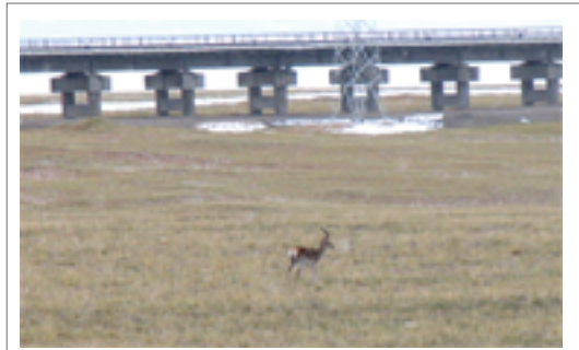
The 1142 km section of the railroad from Golmud to Lhasa traverses the vast high altitude plains once mostly inhabited only by wild animals such as the Tibetan antelope, or chiru. The chiru is increasingly endangered as these areas, protected in the past by their remoteness, have become increasingly accessible as a result of road and rail construction, and the greater availability of suitable vehicles.

This means that the entire QTEC as it slices across Hoh Xil is now defined as being four kilometres wide, excluding UNESCO from any power to limit human use. The migrating female antelopes will have to navigate across QTEC without protection.