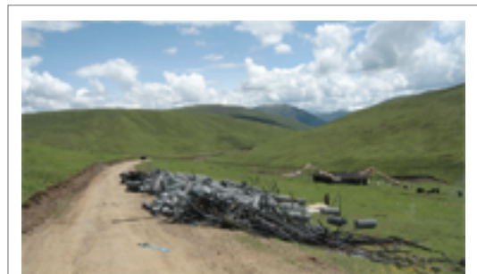
China's current land use policies create further dangers for wildlife – the habitat and mobility of Tibetan antelopes have been threatened in recent years by large-scale poaching and fencing off the grasslands as part of settlement policy.

China's current land use policies create further dangers for wildlife – the habitat and mobility of Tibetan antelopes have been threatened in recent years by large-scale poaching and fencing off the grasslands as part of settlement policy outlined above. [9]