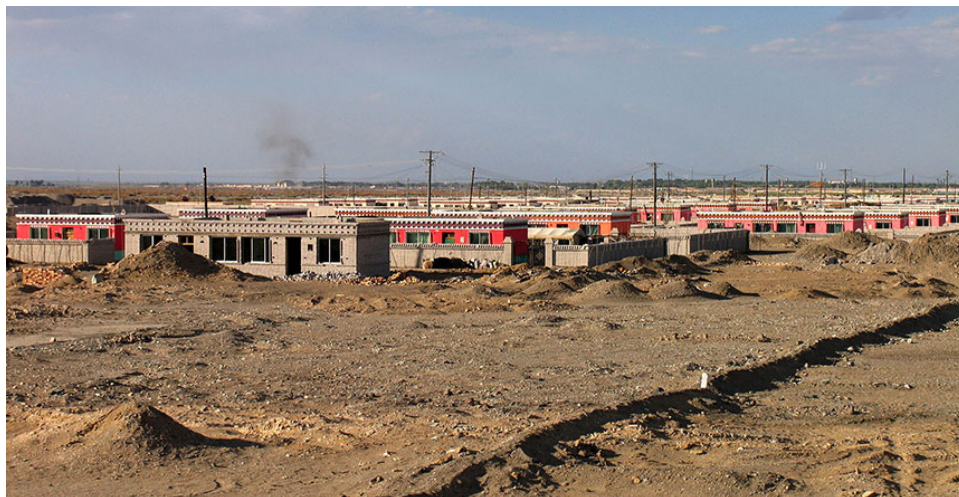
Nomad resettlement housing near Golmud, Tibet.