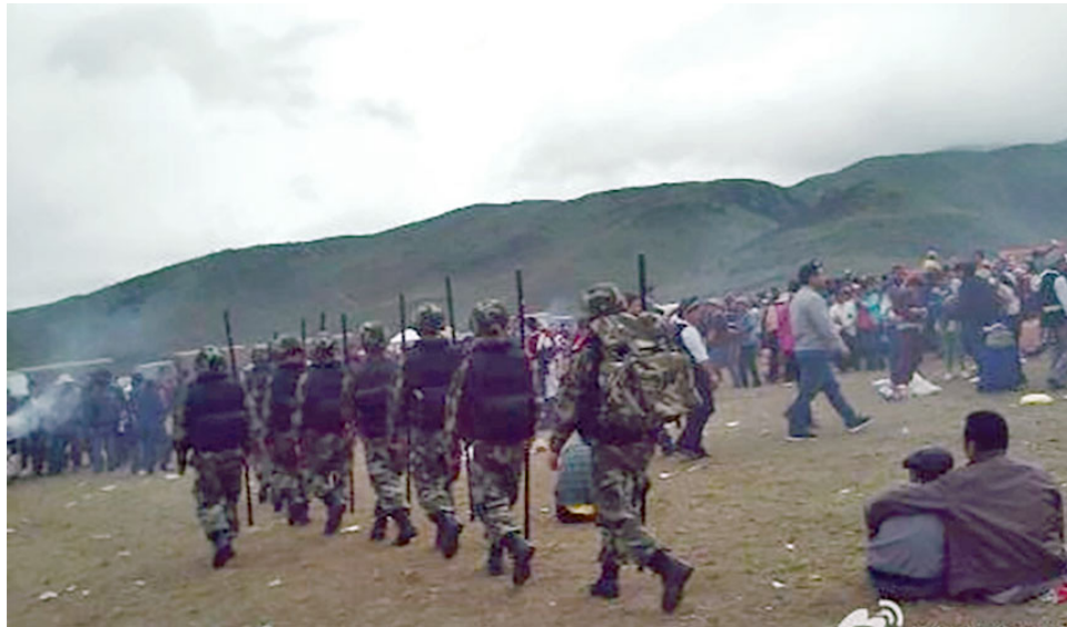
Horsereading festival near Gyalthang, Dechen Tibetan Autonomous Prefecture, Yunnan province, 2012.

In 2014, the confidence of the Chinese authorities in showcasing Lhasa in particular after the protests and crackdown of 2008 was evident in its hosting of a Tourism Expo, that has become an annual event. In 2016, it attracted "400 overseas guests, who were foreign ambassadors in China, diplomatic corps from Northeast Asia and South Asia, foreign journalists and overseas merchants from 15 countries and regions, including the United States, France, Republic of Korea and Pakistan". [80]