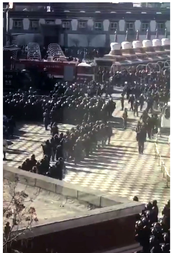
This image depicts troop deployment at Kumbum in order to ensure tight control over the Monlam Chenmo Great Prayer Festival.

As a result of the tighter security in the border areas as well as the crackdown in Tibet since 2008, there has been a dramatic decline in Tibetans escaping from Tibet into Nepal in the past decade. Figures cited by Nepalese immigration officials demonstrated a drop from 1,248 Tibetans in 2010 to 85 applications for an exit permit to India (showing transit via Nepal) in 2015. Department of Immigration (DoI) Director General Kedar Neupane acknowledged the stricter controls on both sides of the border, but also revealed how Nepalese officials often use the language of Chinese propaganda when he was cited as saying that: “Tibetans are opting to stay in their homeland because of declining fervor over the Dalai Lama.” [132]