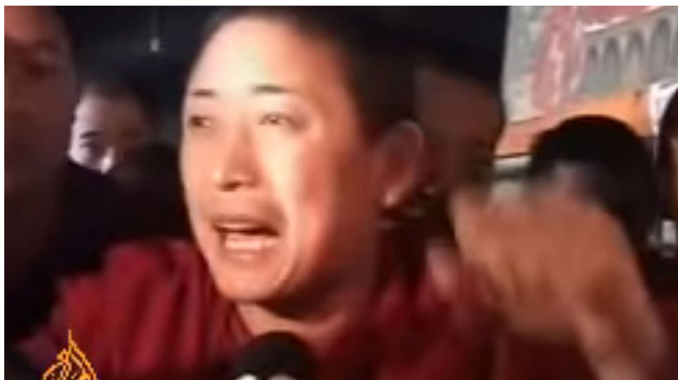
Jokhang monks bravely speak directly to visiting journalists in 2008.