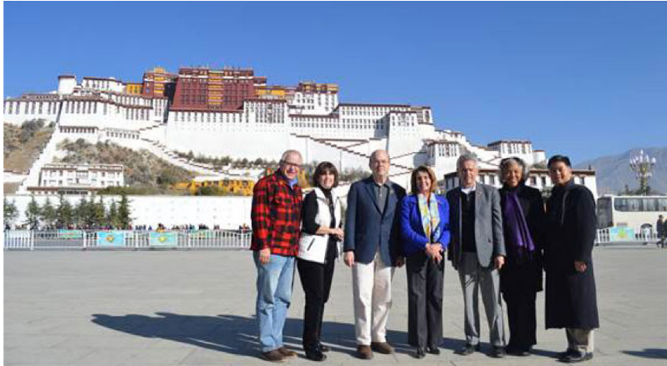
Democratic Leader Nancy Pelosi and her delegation in front of the Potala in Lhasa, Tibet, in 2015.

the visit, Minority Leader Pelosi said: “There were people who – shall we say – had walkie-talkies that may not have been identified as security who are part of the mass movement through the – down the path and through the old part of Tibet. But, those same people, right from the start, kind of complained that there was too much ‘Tashi Delek’ [a traditional Tibetan greeting] going on between us and the people who were standing around. They were like: ‘She wasn’t supposed to be doing that.’” Congressman Jim McGovern, who was also on the visit, said: “I think it’s fair to say that I think the Chinese government wanted to control as much of our visit as they could. And we saw what they wanted us to see. We also saw things that they didn’t want us to see.” [67]