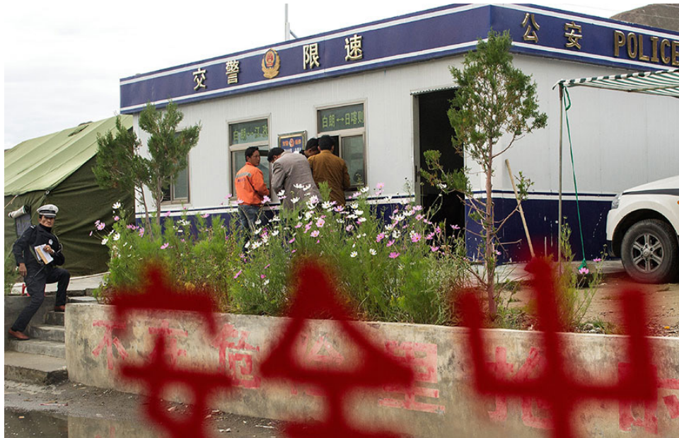
Police checkpoint, Gyantse, Tibet Autonomous Region.

It was Tibetan New Year at Dzongsar monastery in eastern Tibet in early February (2018), and two New York Times journalists had arrived to write about holiday traditions. But as they watched monks rehearsing a traditional monastic dance, a uniformed police officer appeared in the temple and took them away for questioning, beginning a 17-hour period in custody.