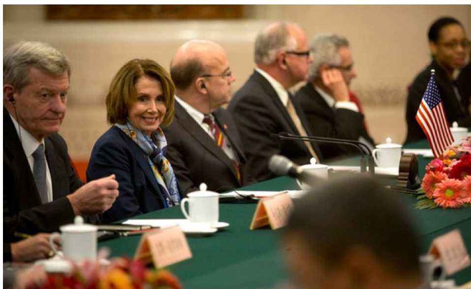
Minority Leader Nancy Pelosi during a meeting with Chinese officials in Beijing.

Special Rapporteurs who joined forces to criticize China's violations of religious freedom in Tibet in 2016 did so without ever being granted access to the areas of concern, [71] including the Larung Gar religious institute in Sichuan, where thousands of homes have been demolished and nuns and monks expelled over the past two years.