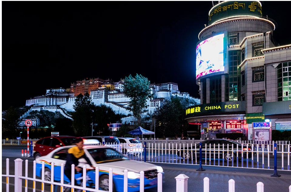
Contemporary Lhasa, showing the Potala Palace, former home of the Dalai Lama.

The Party has expanded its reach even further since Xi Jinping extended his term as Party Secretary and President in February. In line with Xi's slogan "the Party leads everything", past practice of leaving policy implementation to the state has been overhauled in elaborate plans to tighten Communist Party control. There is no mention of guaranteeing rights or interests in the report of the 19 th Party Congress, which represents the Party as "the lone force that can guide China to greatness amid the challenges of a new era." [40]