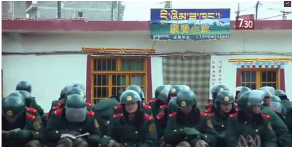
Footage captured by Stephen McDonnell in Ngaba shows a heavy Chinese security presence.

These two examples of Tibetans speaking direct to journalists on official tours were rare and isolated occurrences, unprecedented given China's strategies of blocking and restricting access to numerous groups of foreign government officials, reporters and independent experts.