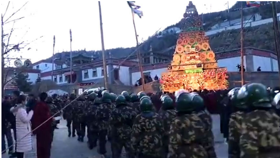
Kumbum monastery, March 2, 2018 troops march in front of the great butter sculpture offering.

State-organized trips to the TAR tend to follow similar itineraries, visiting places that Chinese authorities use to make their strongest case for their rule in Tibet. Arriving in Lhasa, journalists are brought to the Potala Palace, one or more of the major temples and monasteries, and a model business or cooperative. Showing off new infrastructure, including highways and dams, the journalists may then be chauffeured to model towns in Nyingtri (Chinese: Linzhi), a budding tourist center in southern Tibet, and Tsethang (Chinese: Zedang), a historically significant Tibetan town. [106] Other parts of Tibet, such as the sensitive border region of Ngari (Chinese: Ali) and the restive Nagchu prefecture, where a terrifying crackdown has been underway in Driru (Chinese: Biru), remain firmly off the itinerary.