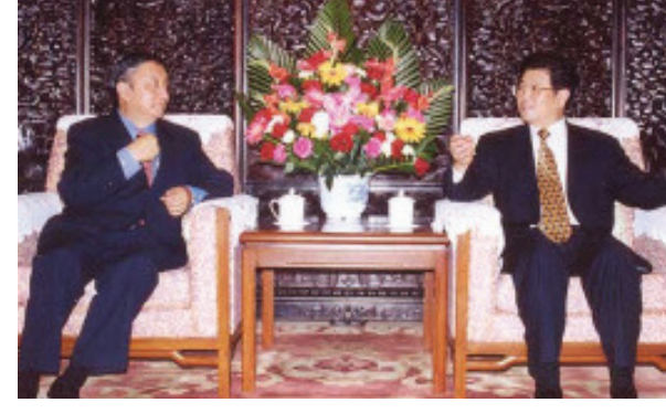
Lodi Gyari meeting with Wang Zhaoguo, head of the Central United Front Work Department of the Chinese Communist Party in September 2002. As a representative of His Holiness the Dalai Lama, Gyari led nine rounds of talks with representatives of the Chinese government.