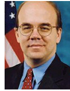
Congressman Jim McGovern (D-MA)