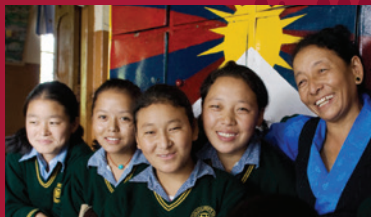
Tibetan refugee children with their instructor at the Tibetan Children’s Village in Suja, India.

“Jacques Rogge, Chairman of the International Olympic Committee, said back in 2002 that he was convinced that allowing Beijing to host the Olympic Games in 2008 would help to improve the human rights situation in China. He was proven wrong big time as the situation especially in Tibet has deteriorated significantly since then. China’s fast economic growth has turned out to be by far more a threat than an opportunity for Tibet. But I am convinced that in the long run a country cannot prosper economically if it keeps on oppressing its people. I fervently hope that this will be the chance for genuine autonomy for Tibet!”