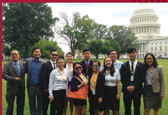
Ten Tibetan-Americans who took part in this year's Tibetan Youth Leadership Program in Washington, DC.

The ninth Tibetan Youth Leadership Program took place in Washington, DC, from June 3 to 7, with 10 participants from across the country. The program is designed to motivate and train young Tibetan-Americans to become effective leaders within the Tibetan community by providing meaningful exposure to the US political process and the discourse around foreign policy in the American capital. Though specifically geared to meet the need to carry the Tibet movement forward in the US, ICT's TYLP is a starting point for greater involvement within the Tibetan community worldwide.