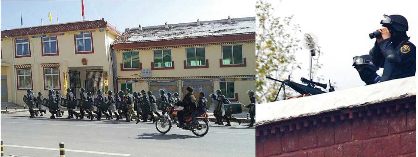
These photographs were captured by tourists in Tibet and posted to the microblogging site Sina Weibo, China's version of Twitter.