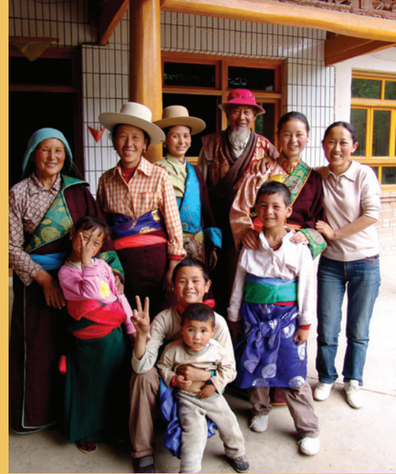
Gill Penney (photographer). 2007. From flickr.com

The International Campaign for Tibet depends on contributions from members to sustain its work in support of Tibet. Your generosity makes a difference.