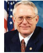
Congressman Joseph Pitts (R-PA)