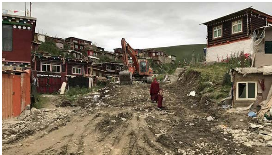
An excavator sits atop a recently razed residential area of Yachen Gar in Sichuan's Kardze prefecture in August, 2017.

A NEW PHASE OF THOUSANDS OF EXPULSIONS OF NUNS AND MONKS HAS BEGUN AT THE WELL-KNOWN RELIGIOUS INSTITUTE OF YACHEN GAR IN EASTERN TIBET, WITH REPORTS THAT THOSE EVICTED ARE NOW BEING SUBJECTED TO “POLITICAL RE-EDUCATION” IN DETENTION IN EXTRA-LEGAL FACILITIES WHERE THERE IS A HIGH RISK OF TORTURE.