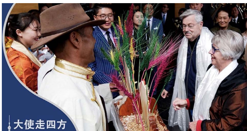
The US Embassy in China posted this photo of Ambassador Branstad in Tibet on its WeChat account.

THE US AMBASSADOR TO CHINA, TERRY BRANSTAD, WAS GRANTED A RARE VISIT TO TIBET BETWEEN 19-25 MAY, DURING WHICH HE REAFFIRMED HIS COUNTRY'S THREE FUNDAMENTAL POSITIONS ON THE ISSUE: DIALOGUE TO RESOLVE THE CONFLICT, RELIGIOUS FREEDOM FOR THE TIBETAN PEOPLE AND ACCESS TO TIBET.