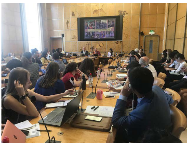
Over 50 diplomats and NGO representatives attended the side-event on religious repression in Tibet.