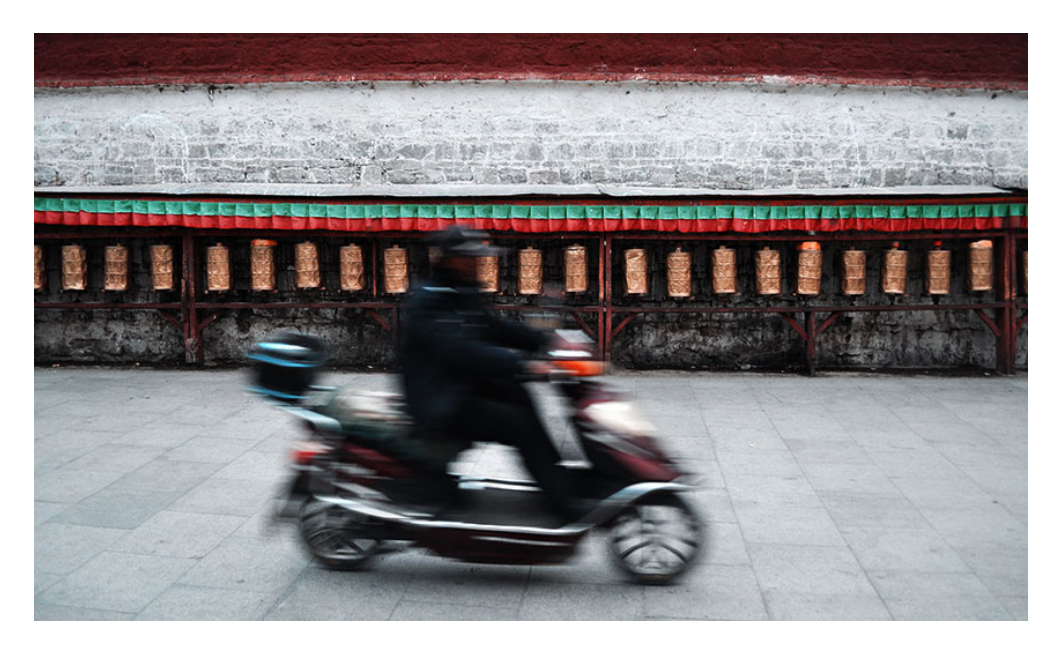
A Tibetan motorcyclist rides around the Potala Palace.