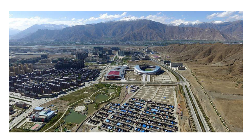
New construction in the Tibetan village of Drip, that has resulted in relocations. One Tibetan reported losing all his farmland when the Princess Wencheng spectacle for Chinese tourists opened opposite the Potala Palace.

Tibetan writer Tsering Woeser is one of the most eloquent and astute writers on the transformation of the city of Lhasa, from the Cultural Revolution – when her father was an official photographer – to today. She says: "Comparing today with the Cultural Revolution, there were no believers kneeling back then, and the temple was ruined, while today the temple offers a bustling scene where believers may freely worship. But these are only superficial differences. Religious worship is still strictly controlled. Furthermore, there is now commercialized tourism, with gawking tourists who treat Tibetans like exotic decorations and Lhasa as a theme park." [63]