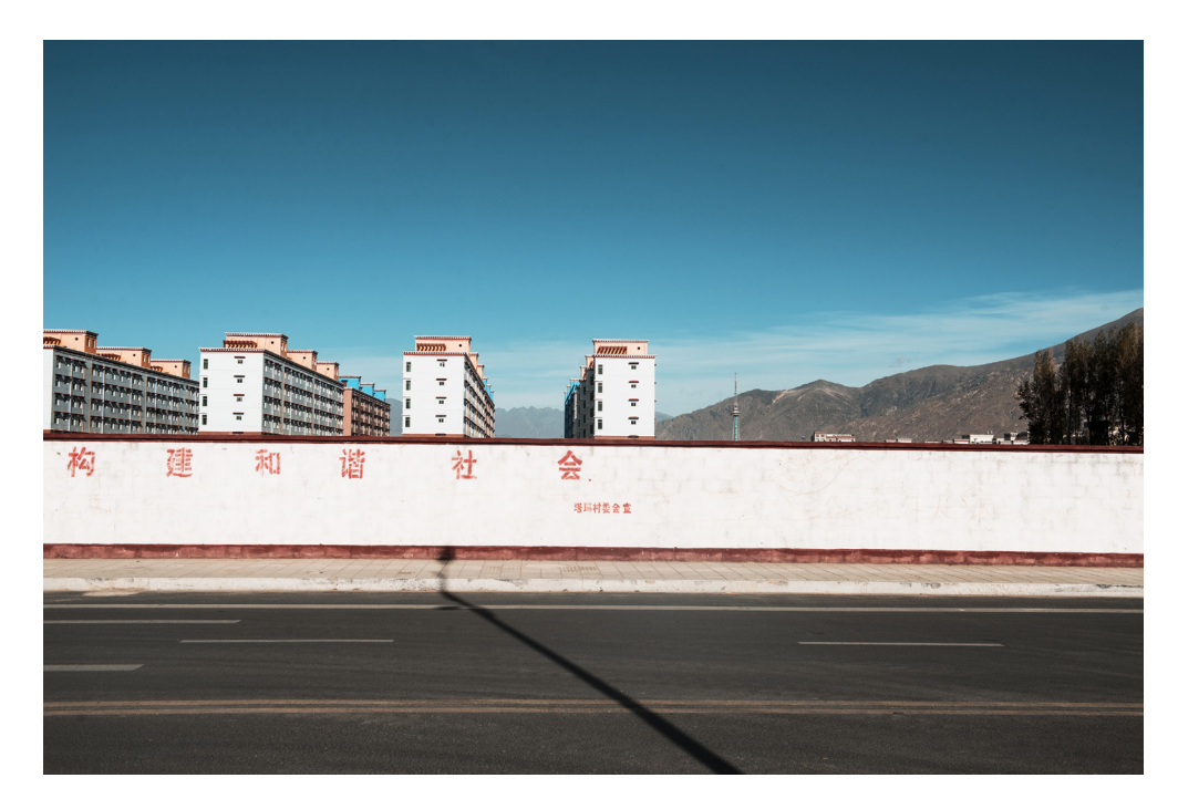
Slogan on a wall in front of new construction in Lhasa reads: "Construct a Harmonious Society".

China's development of Lhasa is an integral part of its policies of urbanisation in Tibet, which has been predominantly rural. Urbanisation is a key mechanism designed to meet economic objectives but with the political agenda of integrating Tibetans into the PRC, undermining 'ethnic autonomy' and ensuring top-down control. The intensified securitization in Tibet is dependent upon urbanisation as well as settlement of Tibetan nomads, because it makes Tibetans easier to administer and control, [50] as well as creating space for Chinese incomers.