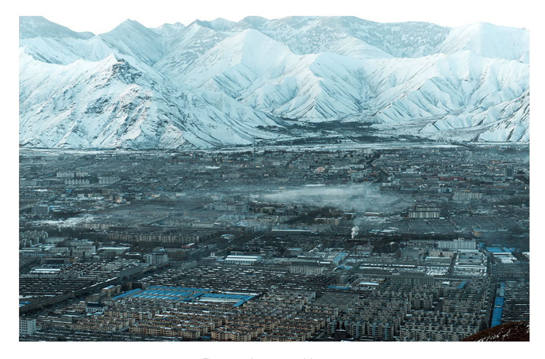
Recent cityscape, Lhasa.