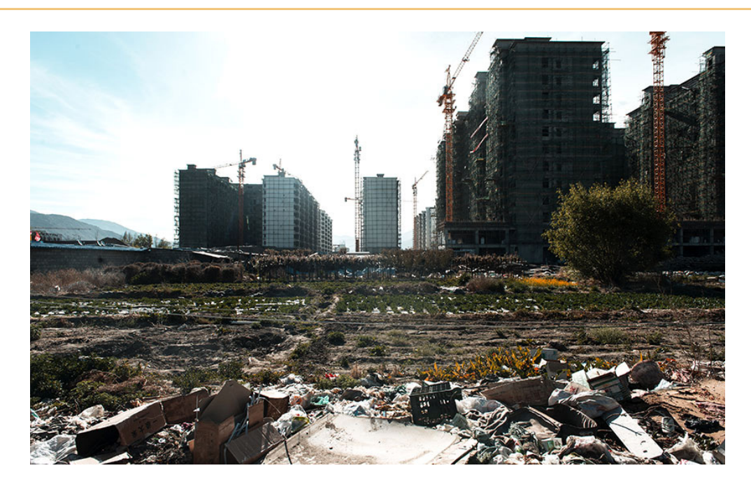
New construction, Lhasa.