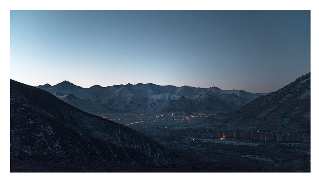
Cityscape at night, showing new developments in the foreground.