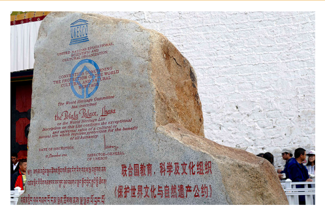
Commemorative stone marking the recognition of the Potala Palace as UNESCO World Heritage in Lhasa.

The three buildings were inscribed as UNESCO World Heritage in 1994, 2000, and 2001 respectively, and are described on the UNESCO World Heritage Committee website as follows: "The Potala Palace, winter palace of the Dalai Lama since the 17th century, symbolizes Tibetan Buddhism and its central role in the traditional administration of Tibet. The complex, comprising the White and Red Palaces with their ancillary buildings, is built on Red Mountain in the center of Lhasa Valley, at an altitude of 3,700m. Also founded in the 7th century, the Jokhang Temple Monastery is an exceptional Buddhist religious complex. Norbulingka, the Dalai Lama's former summer palace, constructed in the 18th century, is a masterpiece of Tibetan art. The beauty and originality of the architecture of these three sites, their rich ornamentation and harmonious integration in a striking landscape, add to their historic and religious interest."<sup>[6]</sup>