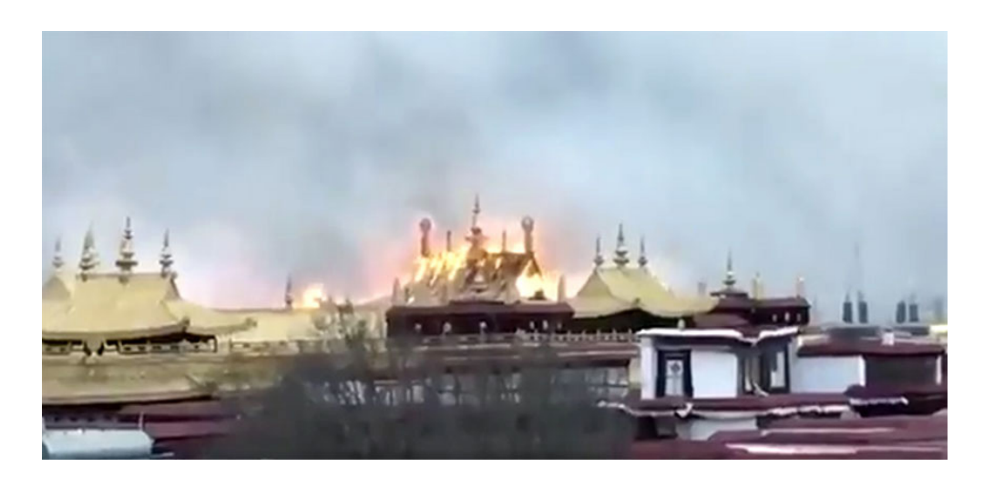
This image of the blaze at the holy Jokhang Temple on February 17, 2018, was captured on social media and circulated online before Tibetans were warned not to send news of the fire outside Tibet.

On the second day of Tibetan New Year, February 17 (2018), a fire broke out in the most sacred temple of Tibet, the Jokhang in Lhasa, Tibet's historic and cultural capital. Videos emerged showing flames shooting from the golden roof of the temple, a place of unparalleled religious importance not only to Tibetans but also to Buddhists across the globe. In the background, the sound of Tibetans weeping in distress and praying could be heard. And then, silence. China's Party state suppressed any news about the fire and rebuffed attempts by international experts to ascertain the damage, even though the Jokhang is a UNESCO World Heritage site. In a telling admission, Tibetans posted emojis of faces with gagged mouths.