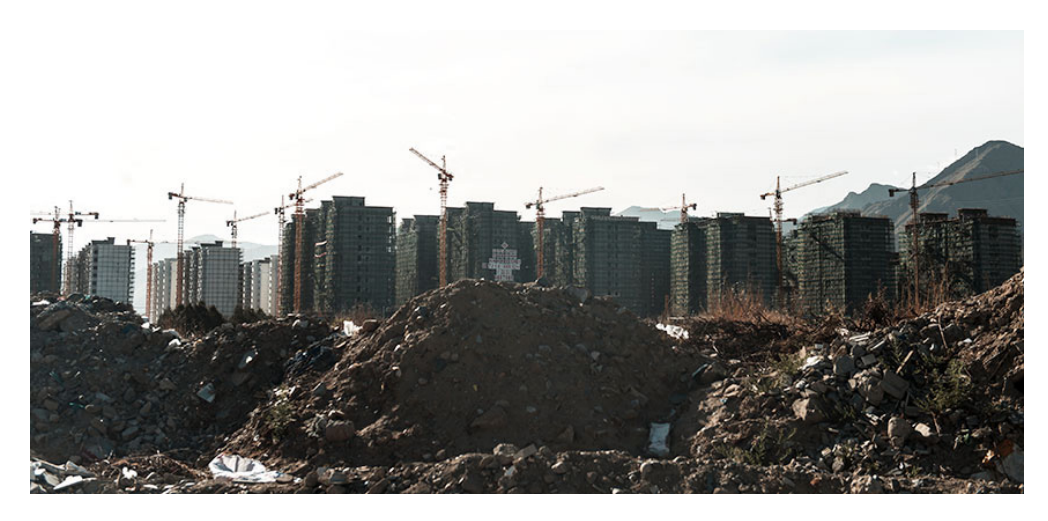
New construction to the east of Lhasa.

The Chinese authorities have sought to 're-brand' Tibet as a grid of tourist itineraries. The creation of a series of 'tour circuits' has been backed up by massive infrastructure investment funded by Beijing, not only the railway to Lhasa and Shigatse, but also regional airports giving tourists glimpses of Tibet's variety of landscapes, architecture, wildlife and heritage.