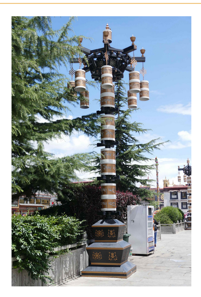
This image, which was taken before the Jokhang fire in February, shows the 'Tibetan-style' streetlights outside the temple.

In one of its only references to protecting culture of the city, a Chinese State Council document on Lhasa's urban planning states not that buildings must be preserved, but that the Chinese authorities must "protect the traditional style and configuration of the city, particularly in the historical urban districts". This is a direct reference to new buildings that have been constructed in Tibetan style. [28]