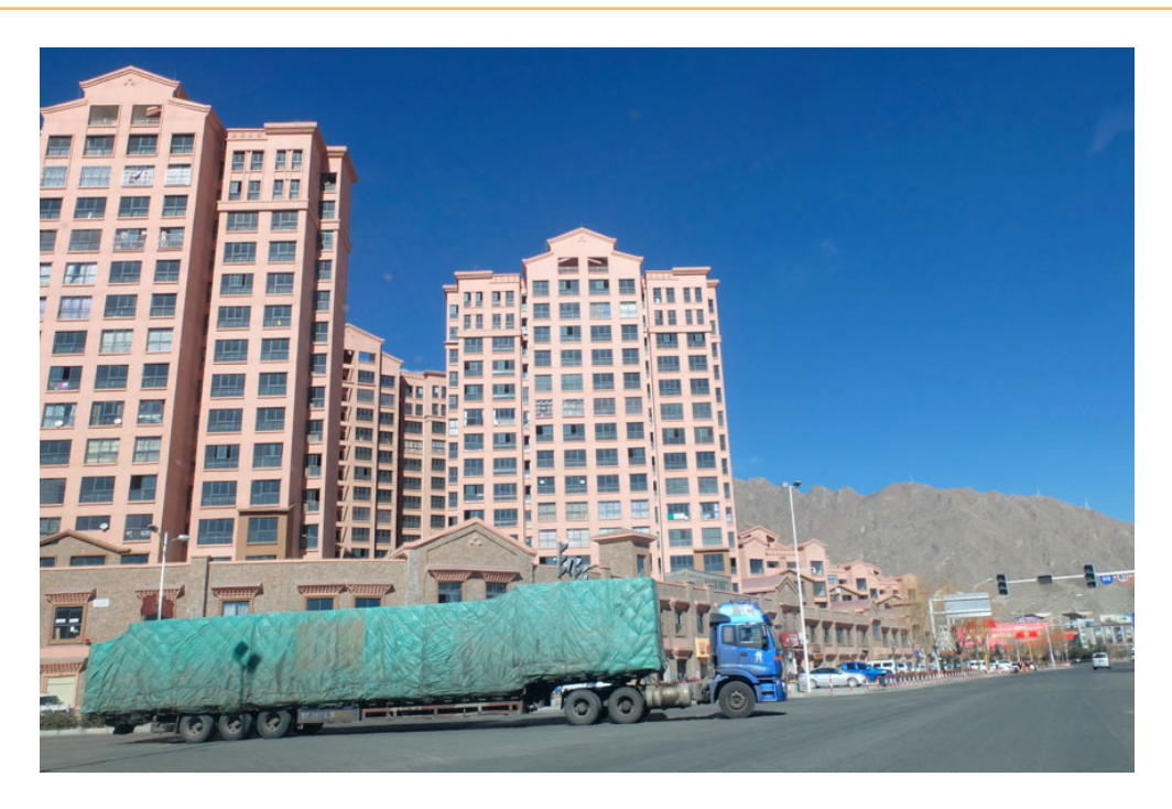
New construction in the Toelung area of Lhasa. The building of the railway station in 2005 involved the relocation of local residents in the area of Ne'u (Chinese: Liuwu) township in Toelung Dechen county (Chinese: Duilongdeqing). (International Campaign for Tibet report 'Tracking the Steel Dragon').