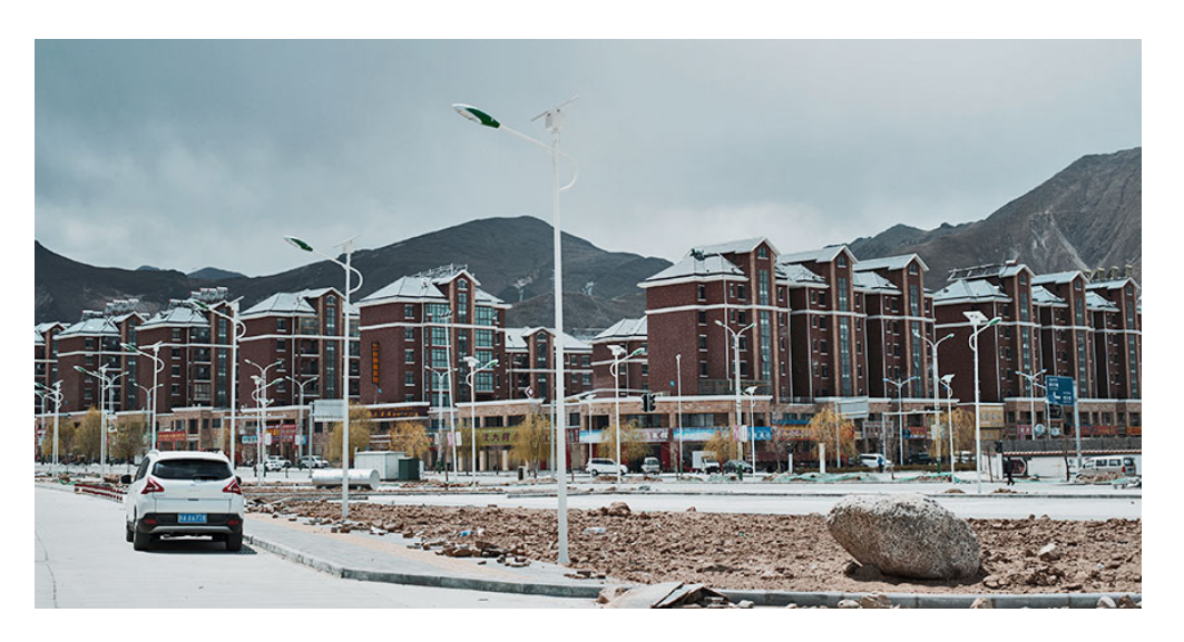
Newly built apartments in the west of Lhasa.