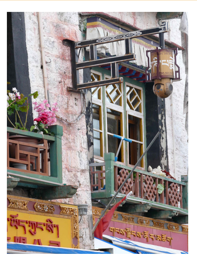
Surveillance camera disguised as a prayer wheel in the Barkhor area.

Given the high political priority ascribed to compliance with top-down planning policy, the recent Chinese State Council response on Lhasa city planning emphasized that enhanced surveillance was in place, if Lhasa citizens had any doubt: "The 'Overall Plan' is the fundamental basis for the development, construction and management of the city of Lhasa, and all construction activities within the urban planning district must comply with the requirements of the 'Overall Plan'. [...] Strengthen mass and social supervision, and raise awareness of social respect for urban planning. All Lhasa-based work