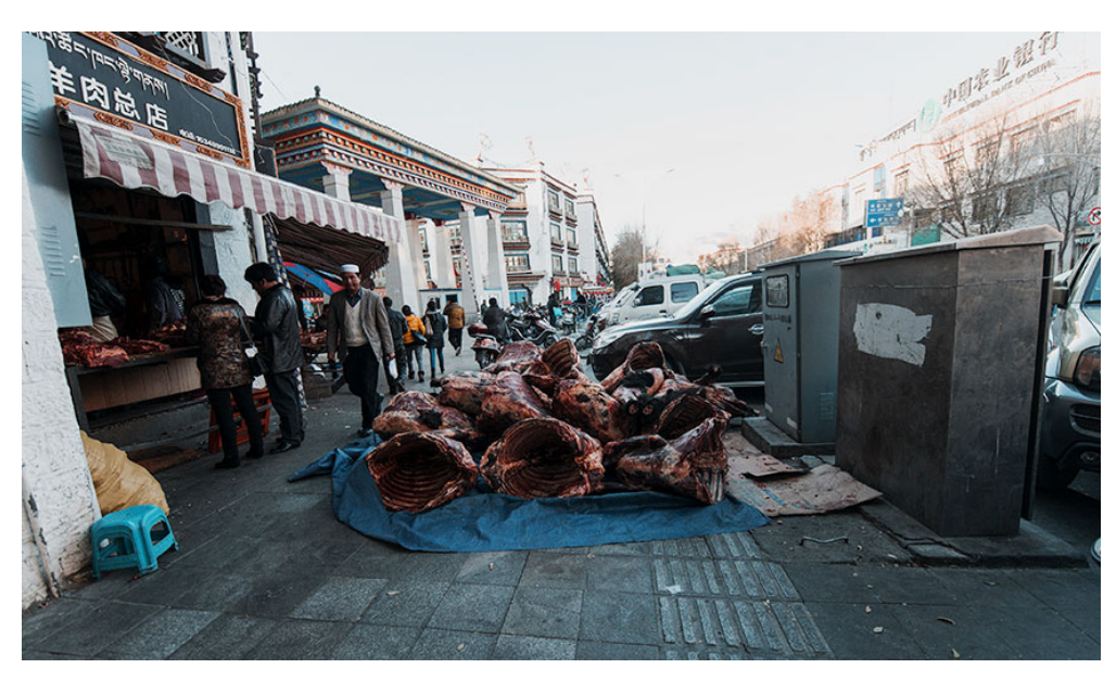
Chinese Hui Muslims selling meat on the streets of Lhasa.