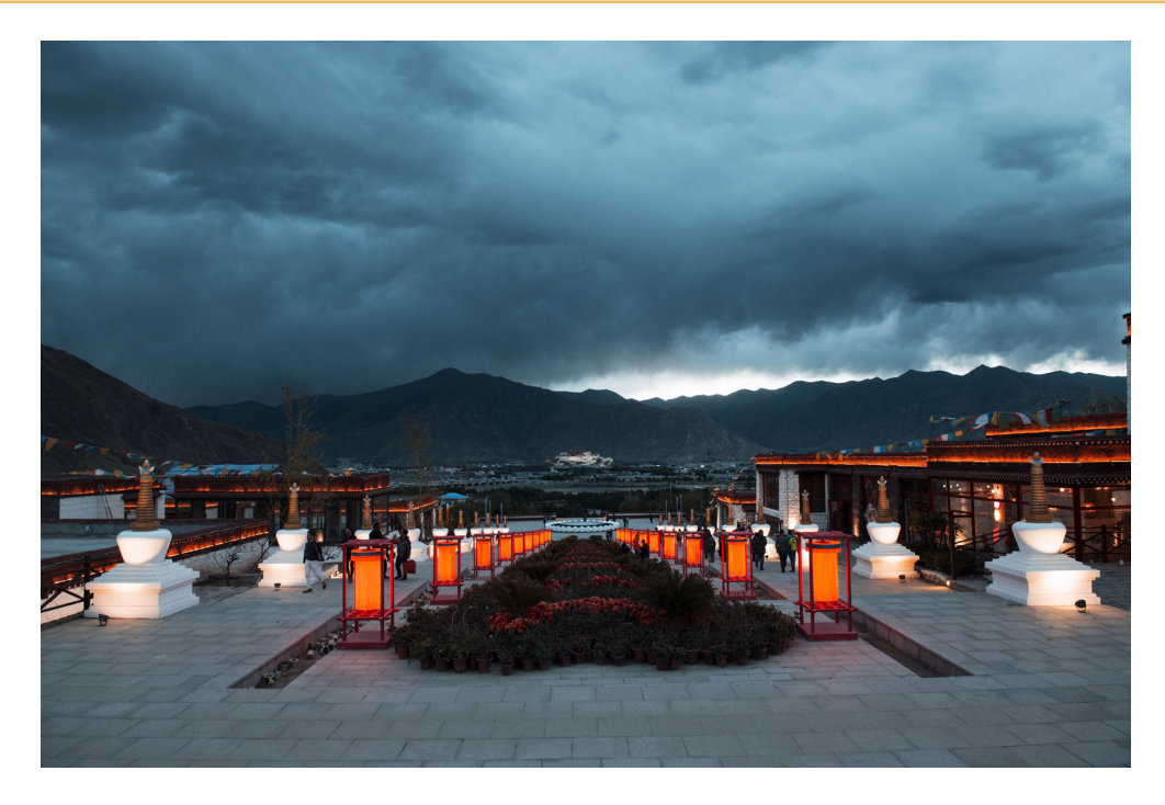
The Princess Wencheng spectacle opposite the Potala Palace. The multi million dollar spectacle is a state-scripted narrative in which the Chinese, embodied by Princess Wencheng of the 7th century, 'civilise' the Tibetans and bring harmony to Tibet. It is designed to boost mass domestic tourism.