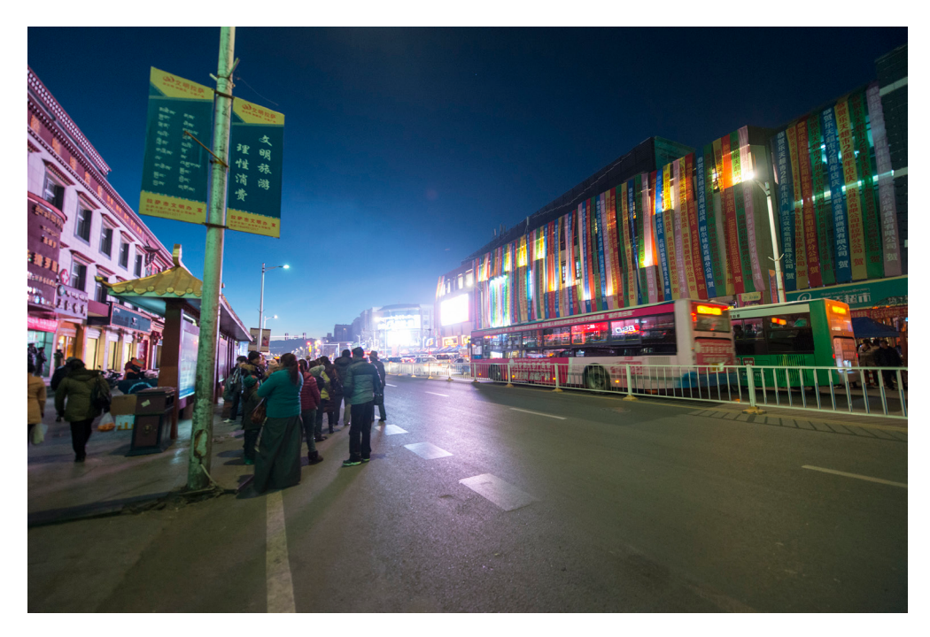
Time Square, Lhasa's latest shopping mall on Beijing Rd, near the Potala Palace. The center includes a large supermarket, cafes and stores selling Chinese and Western brands.

Lhasa is critical to China's 2010-2020 tourism strategy, which names the two main markets as "human culture tourism" and "ecotourism", with "boutique tourist routes" and "safari tourism" for adventurous travellers seeking wild landscapes.