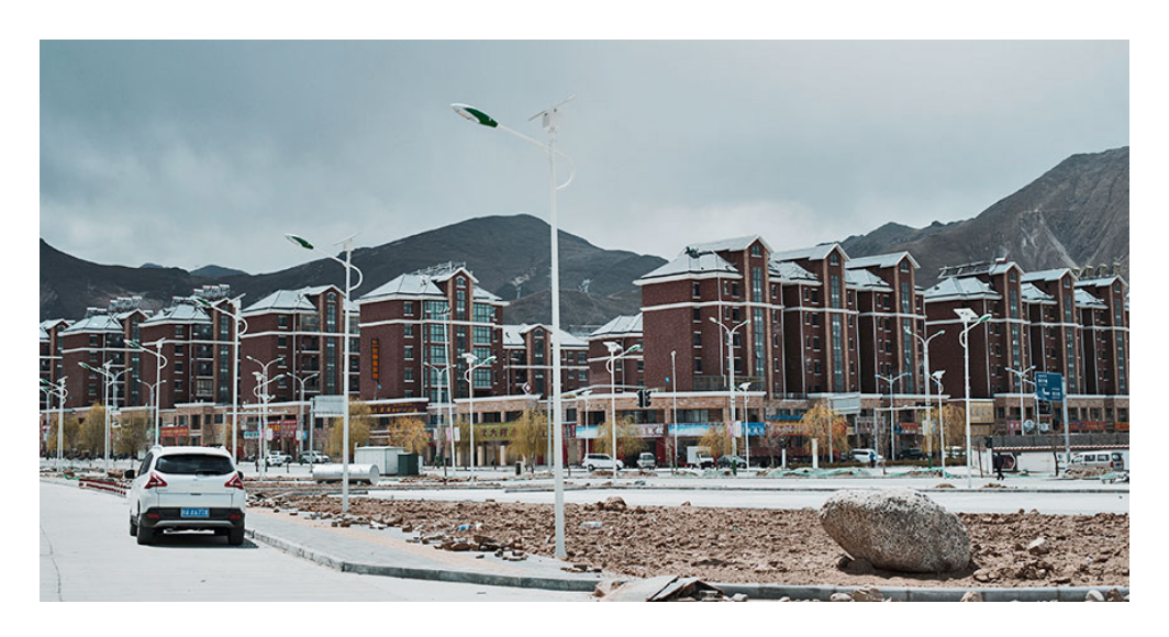
Newly built apartments in the west of Lhasa.