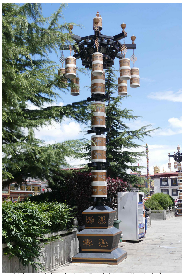
This image, which was taken before the Jokhang fire in February, shows the 'Tibetan-style' streetlights outside the temple.