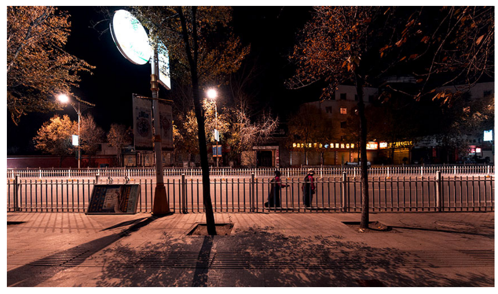
Two Tibetan elderly women doing a pilgrimage on the Lingkor; now Tibetans have to traverse busy roads and cross bridges to follow the holy circuit.