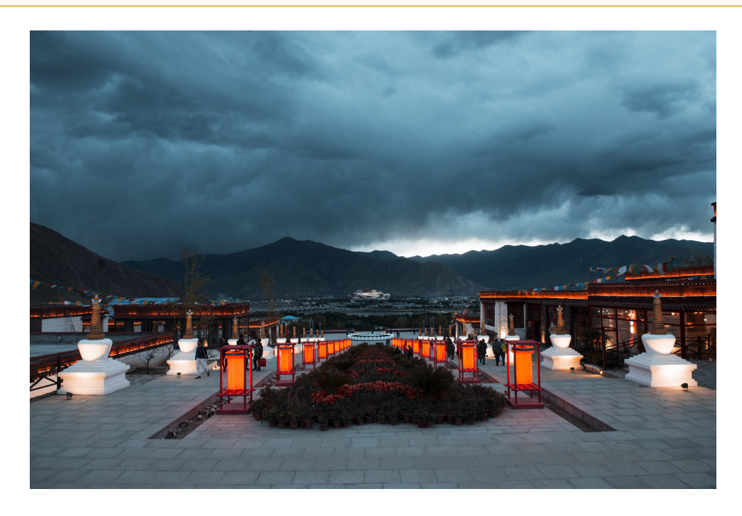
The Princess Wencheng spectacle opposite the Potala Palace. The multi million dollar spectacle is a state-scripted narrative in which the Chinese, embodied by Princess Wencheng of the 7th century, 'civilise' the Tibetans and bring harmony to Tibet. It is designed to boost mass domestic tourism.

After full Chinese Communist rule was imposed in 1959, many private houses, monasteries and other buildings in Lhasa were confiscated and nationalized.