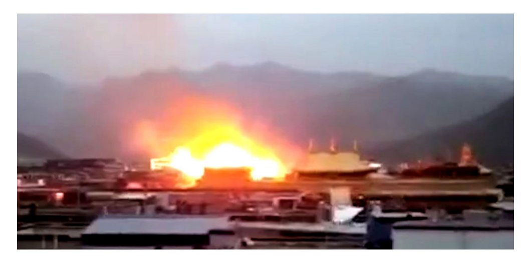
This image of the blaze at the holy Jokhang Temple on February 17, 2018, was captured on social media and circulated online before Tibetans were warned not to send news of the fire outside Tibet.