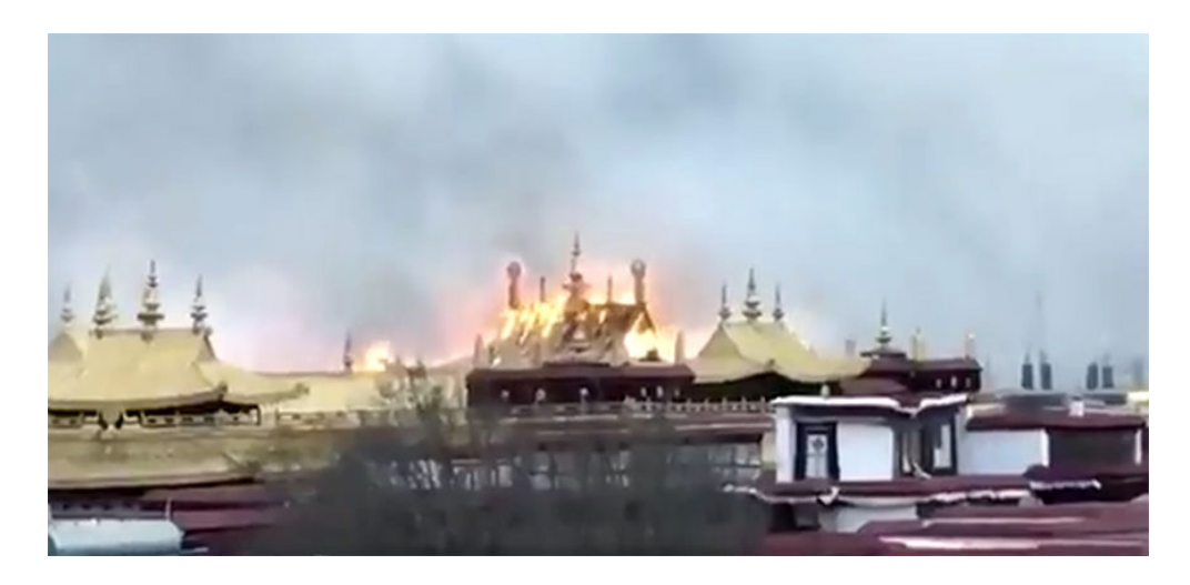
This image of the blaze at the holy Jokhang Temple on February 17, 2018, was captured on social media and circulated online before Tibetans were warned not to send news of the fire outside Tibet.

On the second day of Tibetan New Year, February 17 (2018), a fire broke out in the most sacred temple of Tibet, the Jokhang in Lhasa, Tibet's historic and cultural capital. Videos emerged showing flames shooting from the golden roof of the temple, a place of unparalleled religious importance not only to Tibetans but also to Buddhists across the globe. In the background, the sound of Tibetans weeping in distress and praying could be heard. And then, silence. China's Party state suppressed any news about the fire and rebuffed attempts by international experts to ascertain the damage, even though the Jokhang is a UNESCO World Heritage site. In a telling admission, Tibetans posted emojis of faces with gagged mouths.