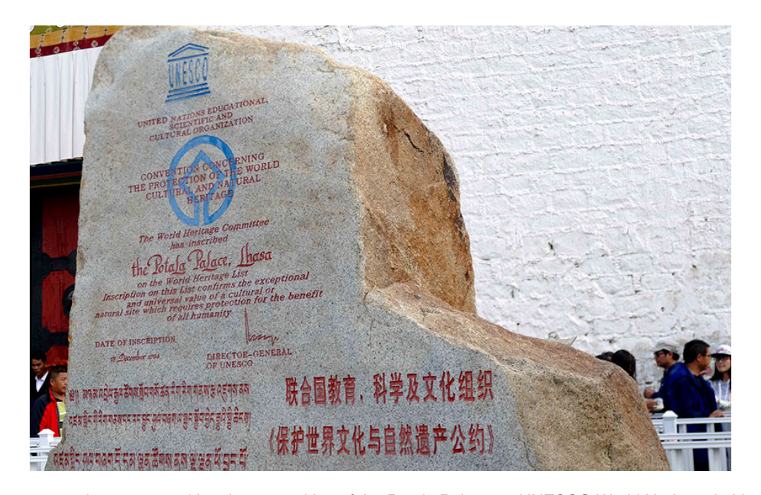
Commemorative stone marking the recognition of the Potala Palace as UNESCO World Heritage in Lhasa.

The three buildings were inscribed as UNESCO World Heritage in 1994, 2000, and 2001 respectively, and are described on the UNESCO World Heritage Committee website as follows: "The Potala Palace, winter palace of the Dalai Lama since the 17th century, symbolizes Tibetan Buddhism and its central role in the traditional administration of Tibet. The complex, comprising the White and Red Palaces with their ancillary buildings, is built on Red Mountain in the center of Lhasa Valley, at an altitude of 3,700m. Also founded in the 7th century, the Jokhang Temple Monastery is an exceptional Buddhist religious complex. Norbulingka, the Dalai Lama's former summer palace, constructed in the 18th century, is a masterpiece of Tibetan art. The beauty and originality of the architecture of these three sites, their rich ornamentation and harmonious integration in a striking landscape, add to their historic and religious interest." [6]