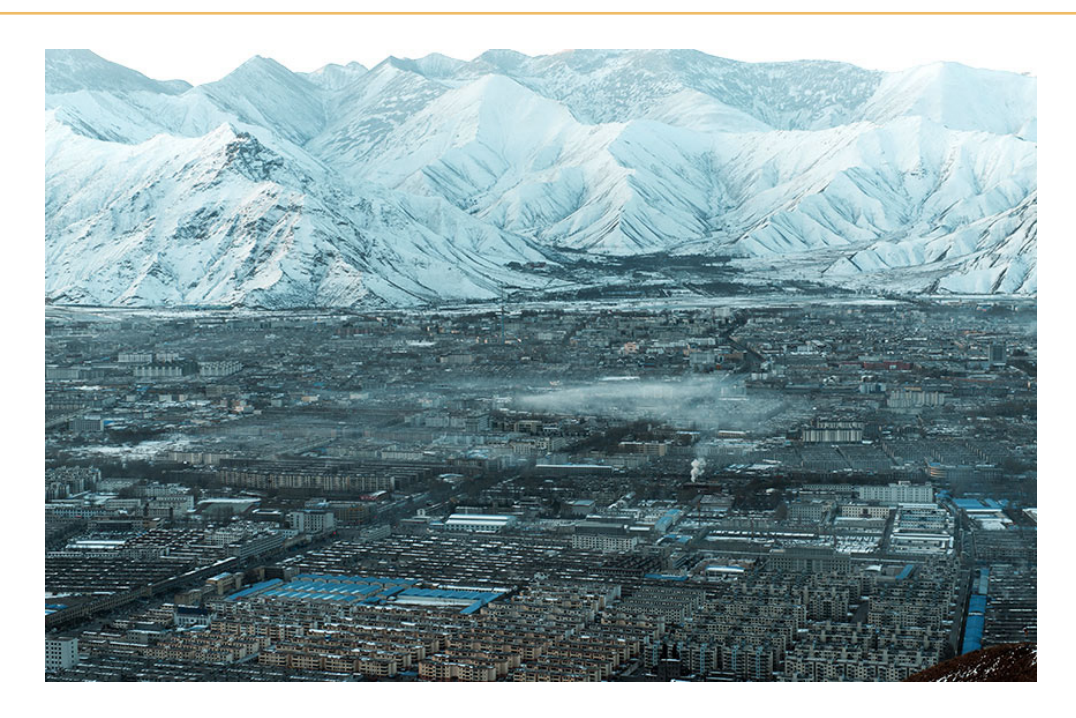
Recent cityscape, Lhasa.