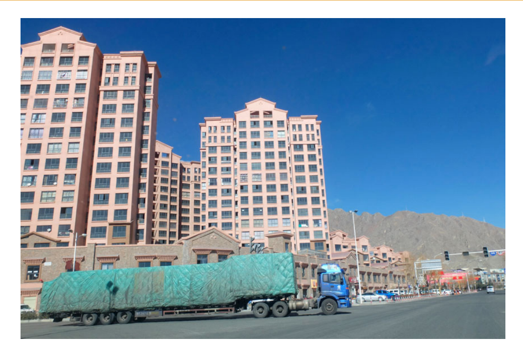
New construction in the Toelung area of Lhasa. The building of the railway station in 2005 involved the relocation of local residents in the area of Ne'u (Chinese: Liuwu) township in Toelung Dechen county (Chinese: Duilongdeqing). (International Campaign for Tibet report 'Tracking the Steel Dragon').