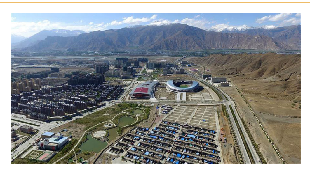
New construction in the Tibetan village of Drip, that has resulted in relocations. One Tibetan reported losing all his farmland when the Princess Wencheng spectacle for Chinese tourists opened opposite the Potala Palace.

Tibetan writer Tsering Woeser is one of the most eloquent and astute writers on the transformation of the city of Lhasa, from the Cultural Revolution – when her father was an official photographer – to today. She says: "Comparing today with the Cultural Revolution, there were no believers kneeling back then, and the temple was ruined, while today the temple offers a bustling scene where believers may freely worship. But these are only superficial differences. Religious worship is still strictly controlled. Furthermore, there is now commercialized tourism, with gawking tourists who treat Tibetans like exotic decorations and Lhasa as a theme park."<sup>[63]</sup>