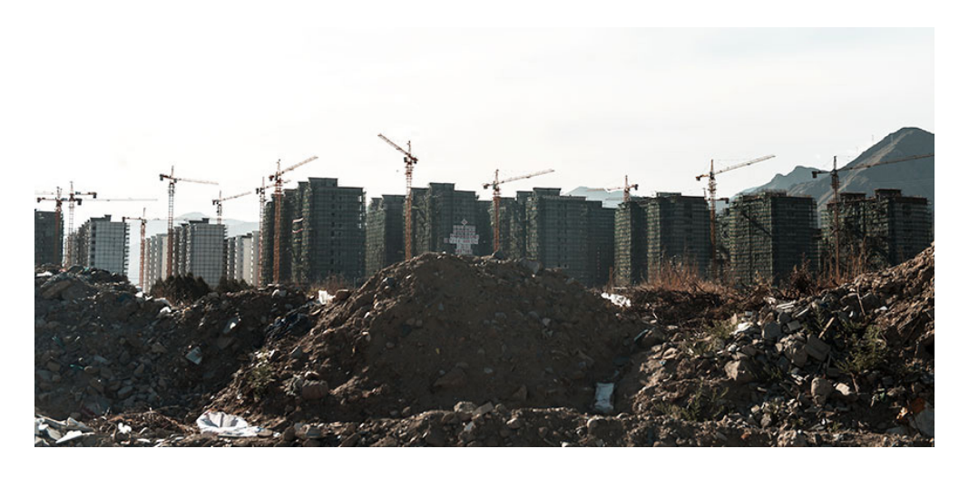
New construction to the east of Lhasa.