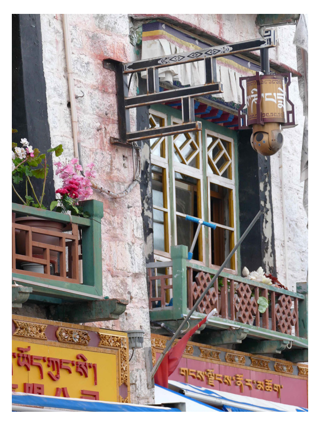
Surveillance camera disguised as a prayer wheel in the Barkhor area.

Given the high political priority ascribed to compliance with top-down planning policy, the recent Chinese State Council response on Lhasa city planning emphasized that enhanced surveillance was in place, if Lhasa citizens had any doubt: "The 'Overall Plan' is the fundamental basis for the development, construction and management of the city of Lhasa, and all construction activities within the urban planning district must comply with the requirements of the 'Overall Plan'. [...] Strengthen mass and social supervision, and raise awareness of social respect for urban planning. All Lhasa-based work units must respect relevant laws and the 'Overall Plan', support the work of the Lhasa City People's Government, strive together, and properly plan, properly build and properly manage Lhasa City." [52]