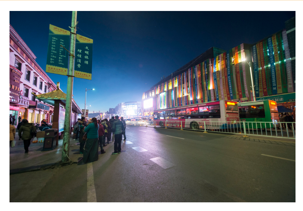
Time Square, Lhasa's latest shopping mall on Beijing Rd, near the Potala Palace. The center includes a large supermarket, cafes and stores selling Chinese and Western brands.

Lhasa is critical to China's 2010-2020 tourism strategy, which names the two main markets as "human culture tourism" and "ecotourism", with "boutique tourist routes" and "safari tourism" for adventurous travellers seeking wild landscapes.