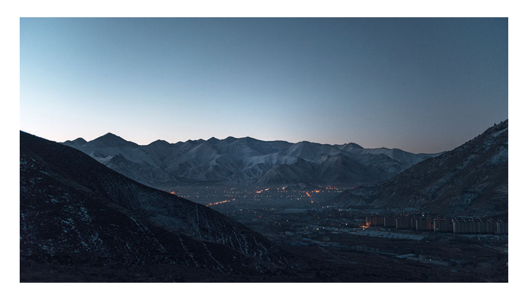
Cityscape at night, showing new developments in the foreground.

It is a measure of what the Jokhang Temple means to Tibetans that after the fire on February 17 (2018), in freezing temperatures, some Tibetan pilgrims began to sleep on the ground outside the temple, demonstrating the level of distress and concern about the fate of this most sacred site, while others carried out prostrations from 4am every day.<sup>[10]</sup>