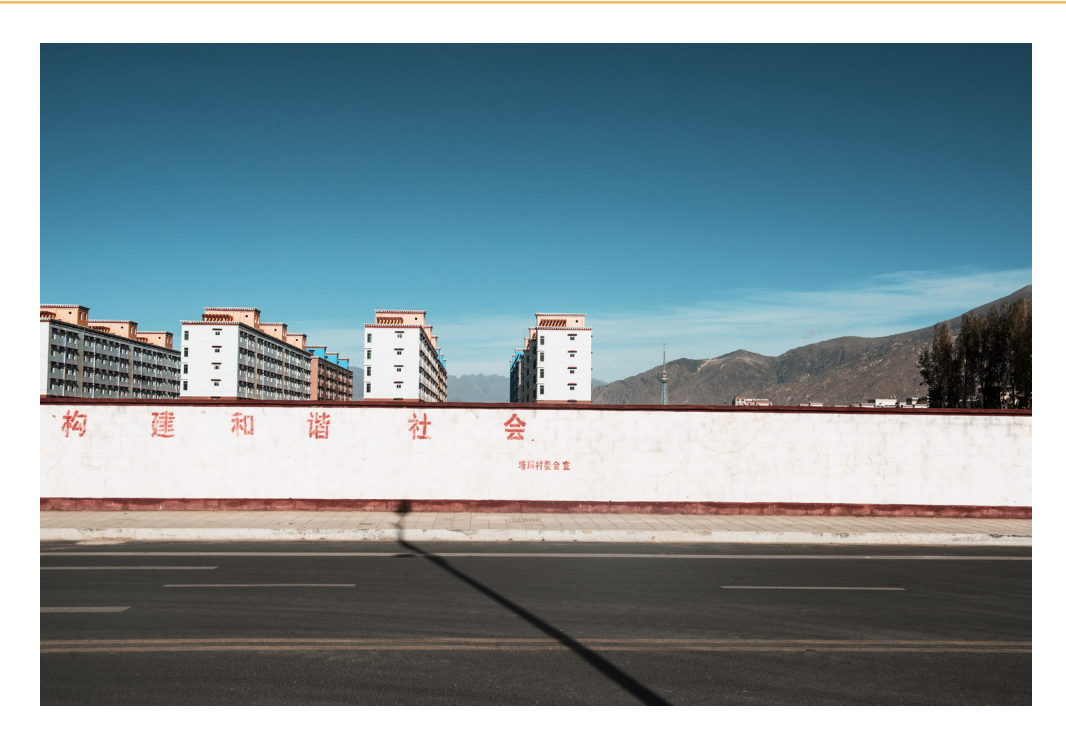
Slogan on a wall in front of new construction in Lhasa reads: "Construct a Harmonious Society".