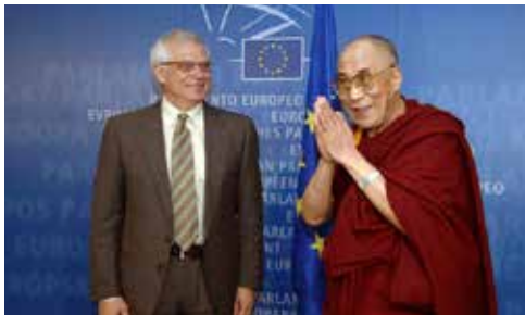
Josep Borrell meets the Dalai Lama in May 2006 during the Tibetan spiritual leader's visit to the European Parliament in Brussels.

AFTER DAYS OF TALKS, NEW EUROPEAN LEADERS WERE APPOINTED IN THE SUMMER.