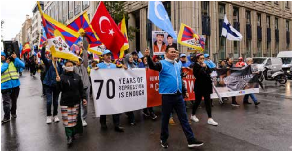
Tibetans, Uyghurs, Hong Kongers and human rights activists walking hand in hand in Brussels on 1 October. The protest was jointly organized by the World Uyghur Congress, the International Campaign for Tibet, the Unrepresented Nations and Peoples Organization and the Uyghur and Tibetan communities of Belgium. (Photo: ICT/eProd).

ON 1 OCTOBER, THE PEOPLE'S REPUBLIC OF CHINA CELEBRATED THE 70 TH ANNIVERSARY OF ITS FOUNDATION IN POMP WITH A NUMBER OF EVENTS IN BEIJING, LHASA AND IN ITS OFFICIAL REPRESENTATIONS WORLDWIDE. BUT AFTER 70 YEARS OF SUBJUGATION AND OPPRESSION, THE TIBETAN PEOPLE HAD ABSOLUTELY NO CAUSE FOR REJOICING.