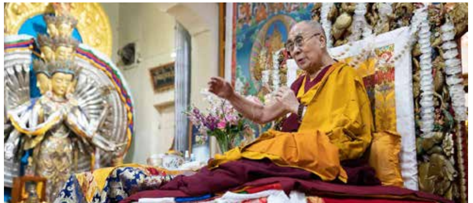
The Dalai Lama at a Long Life Ceremony in the main temple in Dharamsala, India, on 5 July 2019.

CHINESE COMMUNIST PARTY AUTHORITIES HAVE STEPPED UP EFFORTS TO CONTROL THE SUCCESSION OF THE DALAI LAMA, BY HOSTING THEIR FIRST MAJOR TRAINING ON REINCARNATION INVOLVING MONKS FROM PROMINENT TIBETAN MONASTERIES.