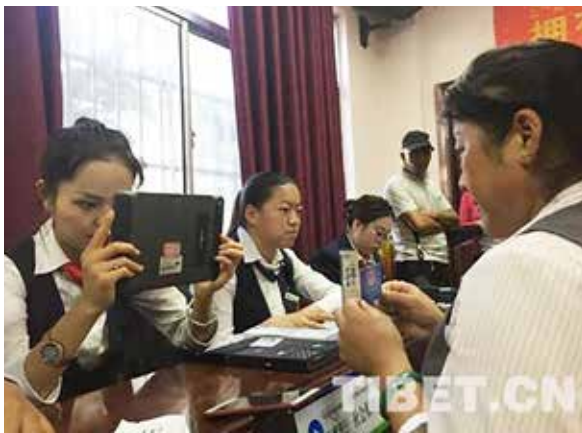
Social security cards have already been distributed to inhabitants of a number of Tibetan cities, including in Lhasa since August 2018.

CHINESE AUTHORITIES ACROSS THE TIBET AUTONOMOUS REGION (TAR) ANNOUNCED THIS SUMMER THE ROLLOUT OF SOCIAL SECURITY CARDS, PROMPTING FEARS THAT THESE COULD BE USED TO STRENGTHEN THE GRIP OF THE COMMUNIST PARTY-STATE OVER TIBETANS' LIVES.