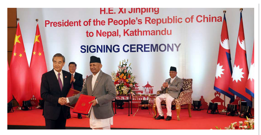
The Nepalese and Chinese foreign ministers exchange an agreement text in the presence of President Xi Jinping and Prime Minister K.P.Oli.

AN UNPRECEDENTED SECURITY CLAMPDOWN TOOK PLACE IN THE NEPALESE CAPITAL KATHMANDU PRIOR TO A VISIT BY CHINESE PARTY SECRETARY AND PRESIDENT XI JINPING'S IN OCTOBER, RAISING ALARM AMONG NEPALIS AND INCREASING CONCERN ABOUT THE FUTURE OF TIBETANS IN THE COUNTRY.