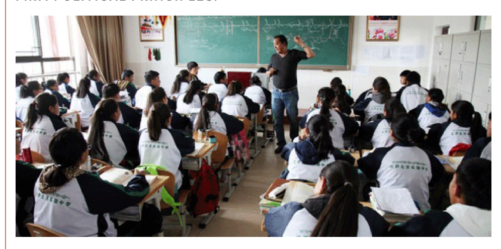
A classroom in a school in Tibet's regional capital Lhasa shown in a 2015 photo.

NEW JOB POSTINGS REVEAL THAT CHINESE AUTHORITIES ARE NOW REQUIRING COLLEGE GRADUATES FROM THE TIBET AUTONOMOUS REGION (TAR) APPLYING FOR JOBS IN PUBLIC INSTITUTIONS TO "EXPOSE AND CRITICIZE THE DALAI LAMA" AND "HAVE CLEAR AND FIRM POLITICAL PRINCIPLES."