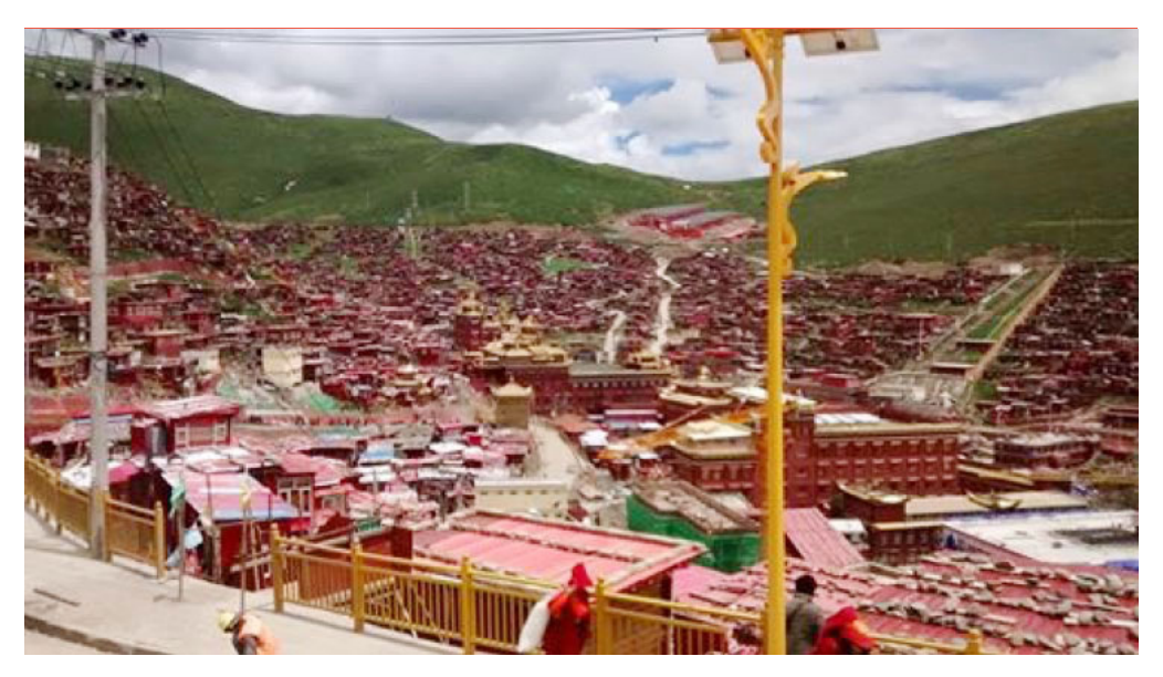
Larung Gar Tibetan Buddhist Academy, summer, 2018.