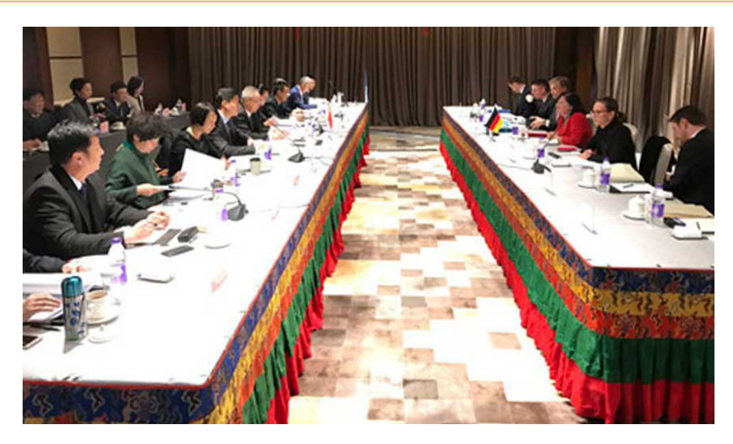
Germany's Commissioner for Human Rights Policy and Humanitarian Aid Bärbel Kofler in Lhasa for the 15th China-Germany Human Rights Dialogue held from December 6 to 8, 2018. It was participated by officials of the Supreme People's Court of China, the United Front Work Department of the Central Committee of the Communist Party of China, the Ministry of Public Security of China, the Ministry of Justice of China.

Xinjiang was rejected by the Chinese government. This was most likely a reflection of the Chinese government's confidence in securing full control in Tibet and ability to stage manage foreign delegations.