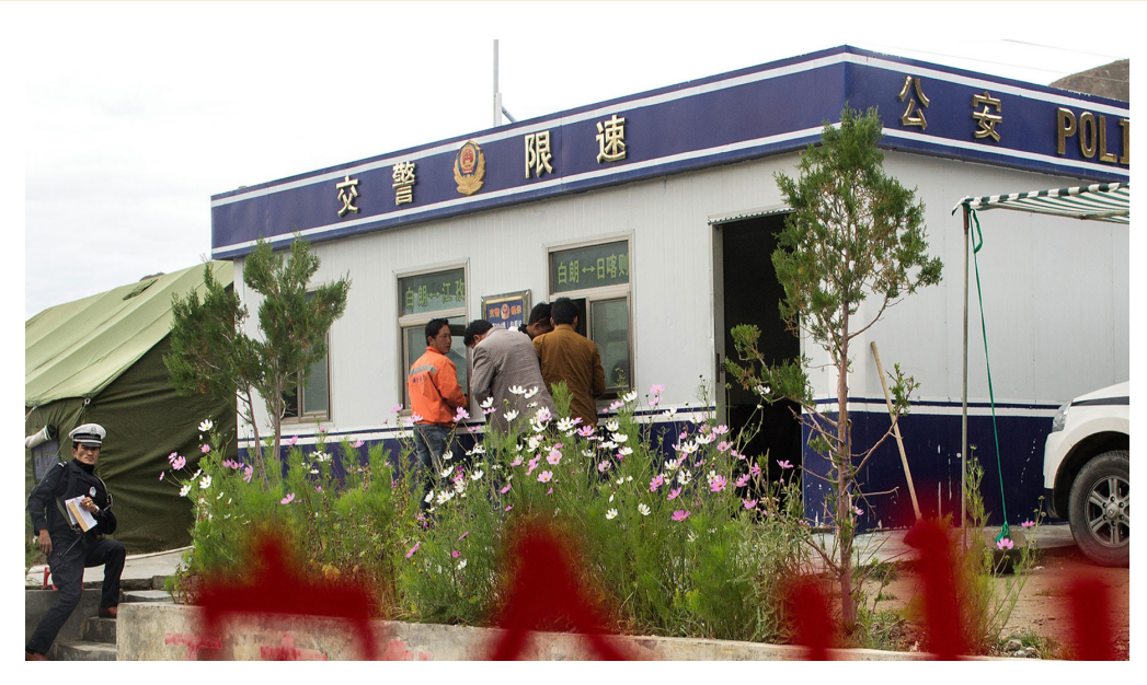
Security checkpoint in the Tibetan Autonomous Region, 2017.

Tibetans in Tibet are increasingly locked in, with restrictions on moving from one place to another, obtaining a Chinese passport, or even leaving the country while in possession of a passport. At the same time, Tibetans in exile are monitored and endure the constant awareness of the possibility of their families in Tibet being targeted if they step out of line even in international capitals. Often it is impossible for them to return to their homeland at all. These restrictions, aimed at a specific ethnicity, treat all Tibetans with the same suspicion Chinese authorities may level at individual Chinese dissidents.