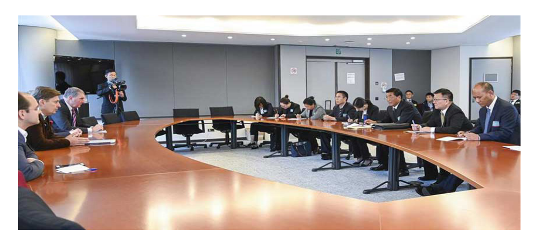
Nyima Tsering (3rd R, front), deputy director of the Standing Committee of the Tibet Autonomous Regional People's Congress, at the European Parliament in Brussels, Belgium, on Oct. 15, 2019.

Handpicked government delegation visits are managed by the Chinese authorities as part of the "please come in, then go and tell the world" approach (the literal translation is "Please come in," or "Welcome to enter," then "Go out").[14]