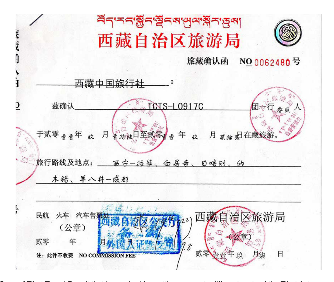
Copy of Tibet Travel Permit that is required for getting access to different parts of the Tibet Autonomous Region. This is posted by travel agencies that operate in TAR.