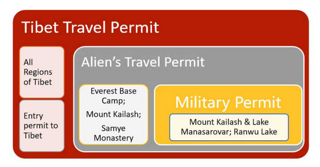
Details of Tibet Travel Permit and other permits that are required for getting access to different parts of the Tibet Autonomous Region. This is posted by travel agencies that operate in TAR.

Inner Mongolia (Mongol rights advocate prefer the name Southern Mongolia. Chinese: Nei Menggu) requires the same tourist visa that grants access to Beijing, Shanghai, and the rest of China. But entering the TAR is impossible without acquiring a Tibet Travel Permit (TTP) and arranging for a state-approved tour guide; no other province-level entity in the PRC has equivalent additional barriers to access.