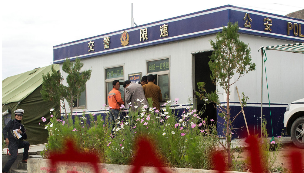
Security checkpoint in the Tibetan Autonomous Region, 2017.

there was a steady outflow of 2500-3500 per year. In 2019, the figure dropped to a staggering low of 18 Tibetans who escaped into exile and were received at the reception center in Dharamsala, India. [65]