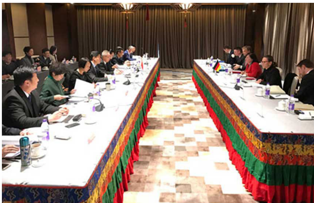
Germany's Commissioner for Human Rights Policy and Humanitarian Aid Bärbel Kofler in Lhasa for the 15th China-Germany Human Rights Dialogue held from December 6 to 8, 2018. It was participated by officials of the Supreme People's Court of China, the United Front Work Department of the Central Committee of the Communist Party of China, the Ministry of Public Security of China, the Ministry of Justice of China.

The coverage of the visit in the Chinese state media referred predictably to the “the outstanding achievements” of the Communist Party leadership under Xi Jinping in Tibet. [40] The German Human Rights Commissioner did not hold a press briefing in Beijing after the visit, as delegations to Tibet once used to do, reflecting the high levels of control by the Chinese authorities over messaging by foreign delegations.