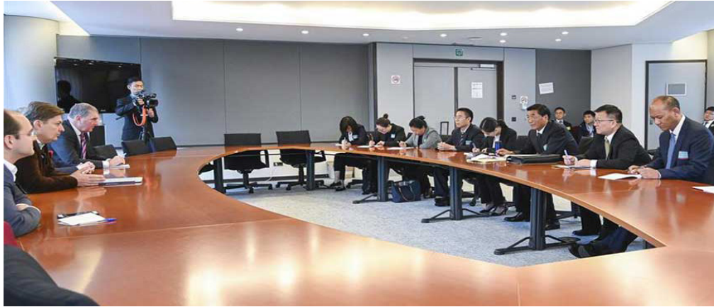
Nyima Tsering (3rd R, front), deputy director of the Standing Committee of the Tibet Autonomous Regional People's Congress, at the European Parliament in Brussels, Belgium, on Oct. 15, 2019.

This is an integral part of a global strategy by the Chinese Communist Party (CCP) not only to hide the realities of what is happening in Tibet today, but to dominate and control discourse and further its political agenda and power. While projected as “soft power,” this can be more accurately termed as the implementation of “sharp power,” which “In the new competition that is under way between autocratic and democratic states [...] should be seen as the tip of [the CCP’s] dagger—or indeed as their syringe.” [15]