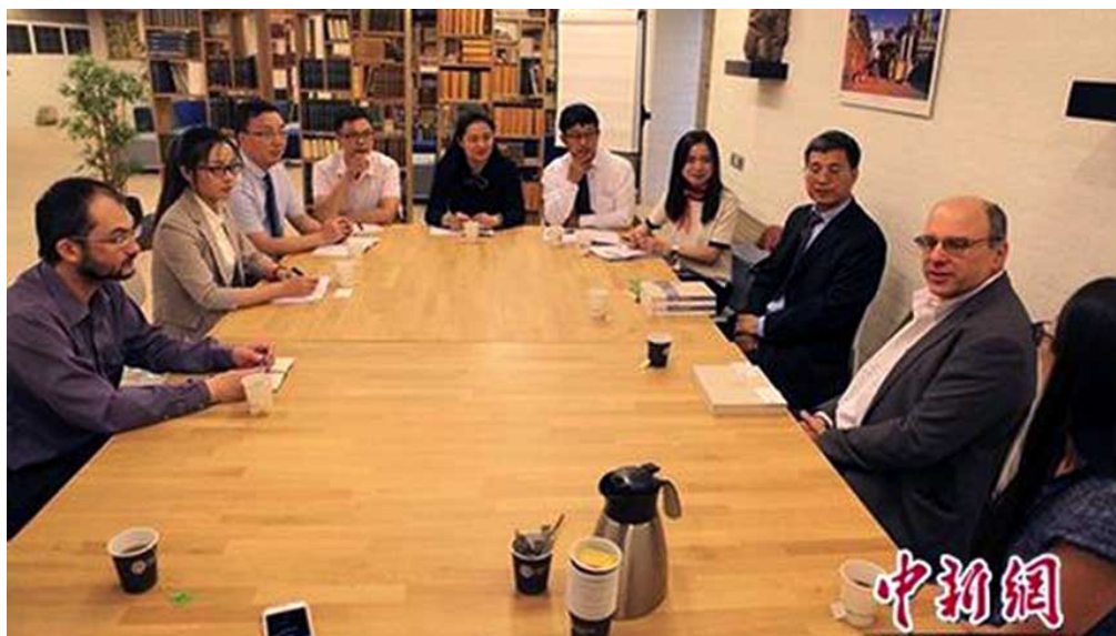
A Chinese delegation on Tibetan studies meeting scholars from Leiden University in the Hague, the Netherlands, on May 25, 2018.

Analysis of the Tibet-related Chinese delegations to the West reveals a political agenda often based on Tibet visits or criticism of China's policies by host governments, and also connected to visits by Tibetan Parliamentarians in exile and the Sikyong (President of the Central Tibetan Administration) Lobsang Sangay – for instance linked to the latter's visits to the Belgian Parliament, the French Senate, and Lithuania. Previously, official Chinese delegations have coincided with the Dalai Lama's overseas trips to these countries, in largely unsuccessful attempts to undermine and undercut his message, but this has been less visible in 2019, as the Dalai Lama did not make foreign trips.