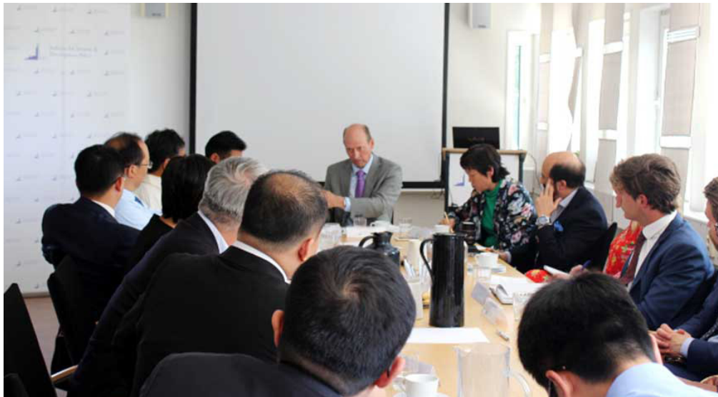
The Institute for Security and Development Policy in Stockholm organized a roundtable with a delegation from the Tibetan Academy of Social Sciences, the Chinese Academy of Social Sciences and the China Tibetology Research Center on June 25, 2018.

The hosts in the West of these delegations, including respected scholarly institutions, think-tanks, and governments, may not always be aware that while their purpose is presented as engaging in dialogue (and while sometimes a level of engagement may indeed be possible), ultimately these delegations are part of China's strategic information operations, reflecting the vigorous propaganda efforts of the United Front Work Department. Official Chinese delegations to the West are tightly controlled, and every intention is made to ensure they have the opportunity to issue boilerplate statements without challenge at non-public events. Meetings with ordinary Tibetans in the diaspora who might raise sensitive questions are avoided, and mostly governments and even civil society and academic hosts concede to their specifications.