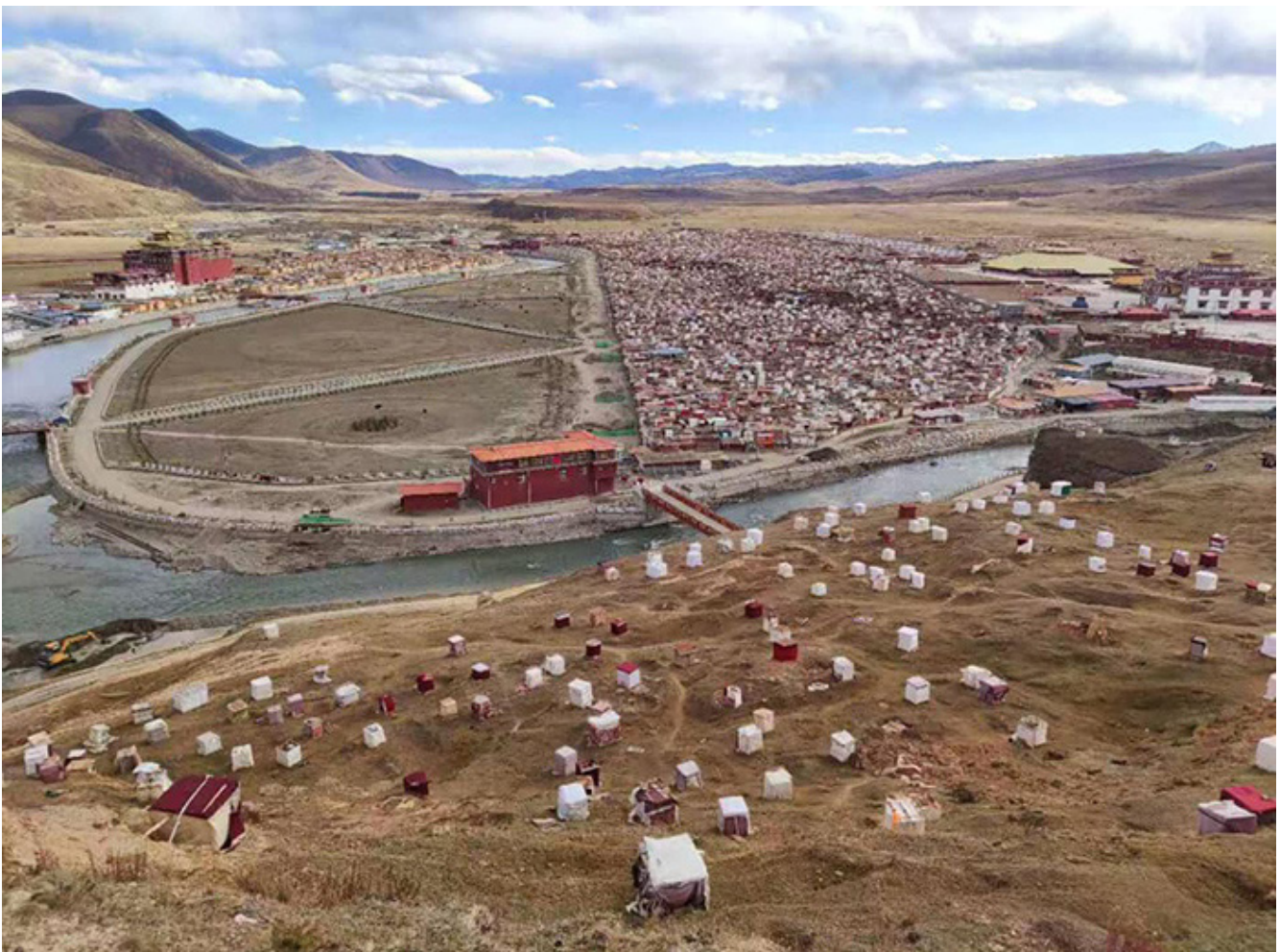
Picture of Yachen Gar taken in November 2020 revealing the scale of destruction.

Similarly, over 6,000 monastics were expelled from Yachen Gar Buddhist Institute in early 2019. [57] Any hope of joining monasteries in the Tibet Autonomous Region stood no chance in the face of administrative measures explicitly restricting monks and nuns from traveling freely in pursuit of knowledge.