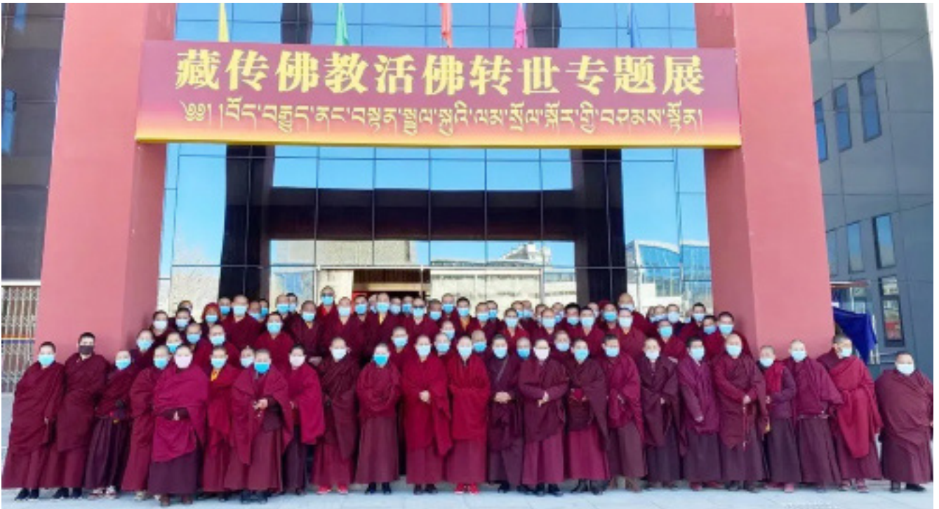
Propaganda exhibition in Lhasa for 100 monks and nuns from Chushur (Qushui) County undergoing “Complying with Four Standards for Monks and Nuns.” The exhibition projects Tibetan reincarnation system as being managed by the central government of China between Yuan through Qing dynasties.

The National Religious Work Conference in 2016 saw Xi Jinping calling for the party to consolidate its United Front with religious communities in order “to achieve the Chinese dream of the great rejuvenation of the Chinese nation.” [44] With the revision of the Religious Affairs Regulations in 2017 putting into practice the proceedings of the National Religious Work Conference, an ideological control