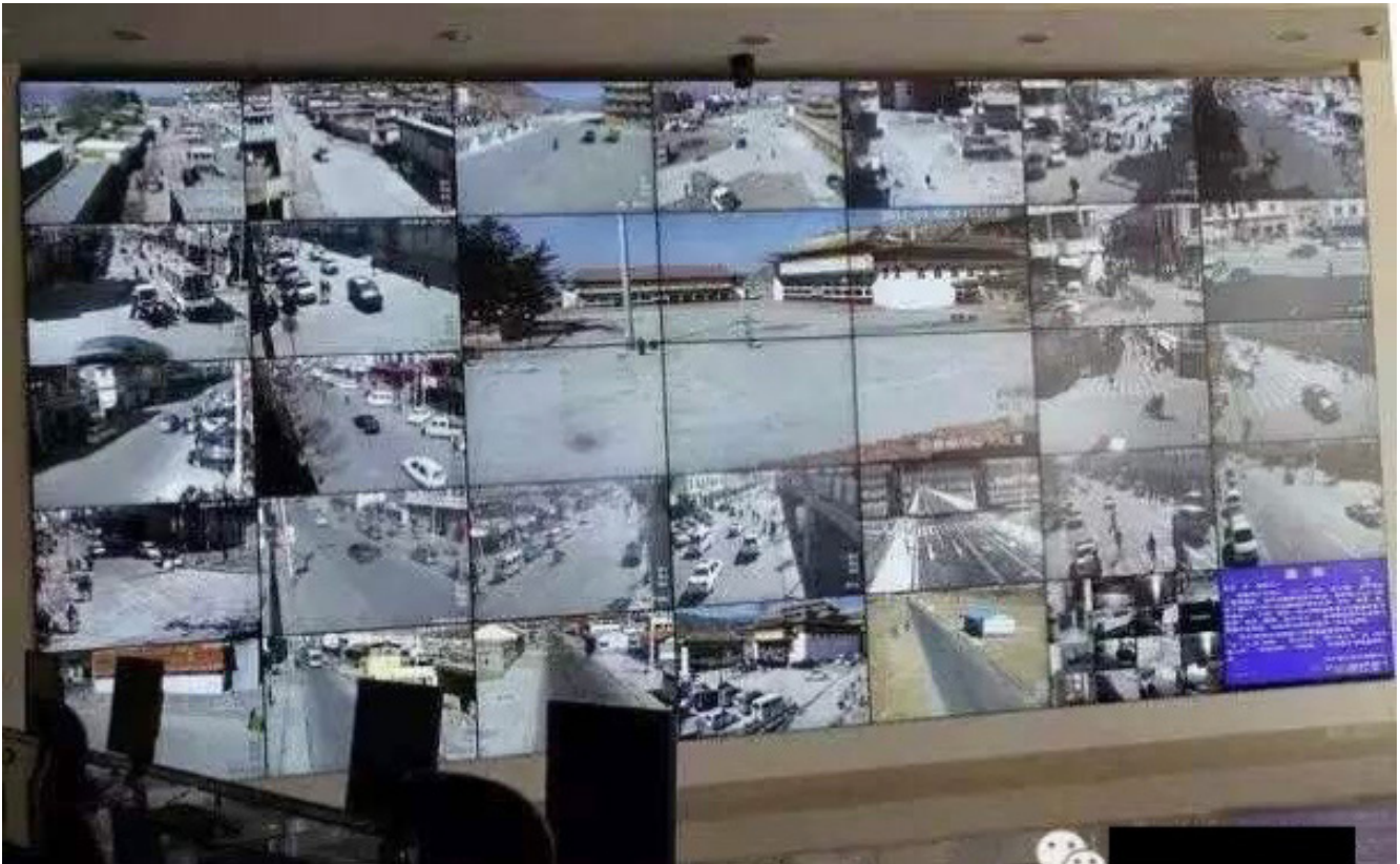
Surveillance cameras control room at Kirti Monastery in Ngaba (Aba), Sichuan.

For the party, achieving the ultimate objective of “long-term stability” in Tibet is a work in progress to integrate the Tibetan people in the “great rejuvenation of the Chinese nation.” Multiple policies have been implemented over decades to secure its rule in Tibet: marked by outright violent tactics and innumerable ideological political campaigns.