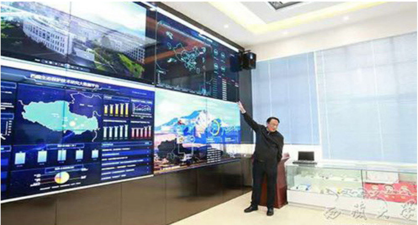
Real-time tourist monitoring screen installed at Tibet University can also be used to ensure political stability.