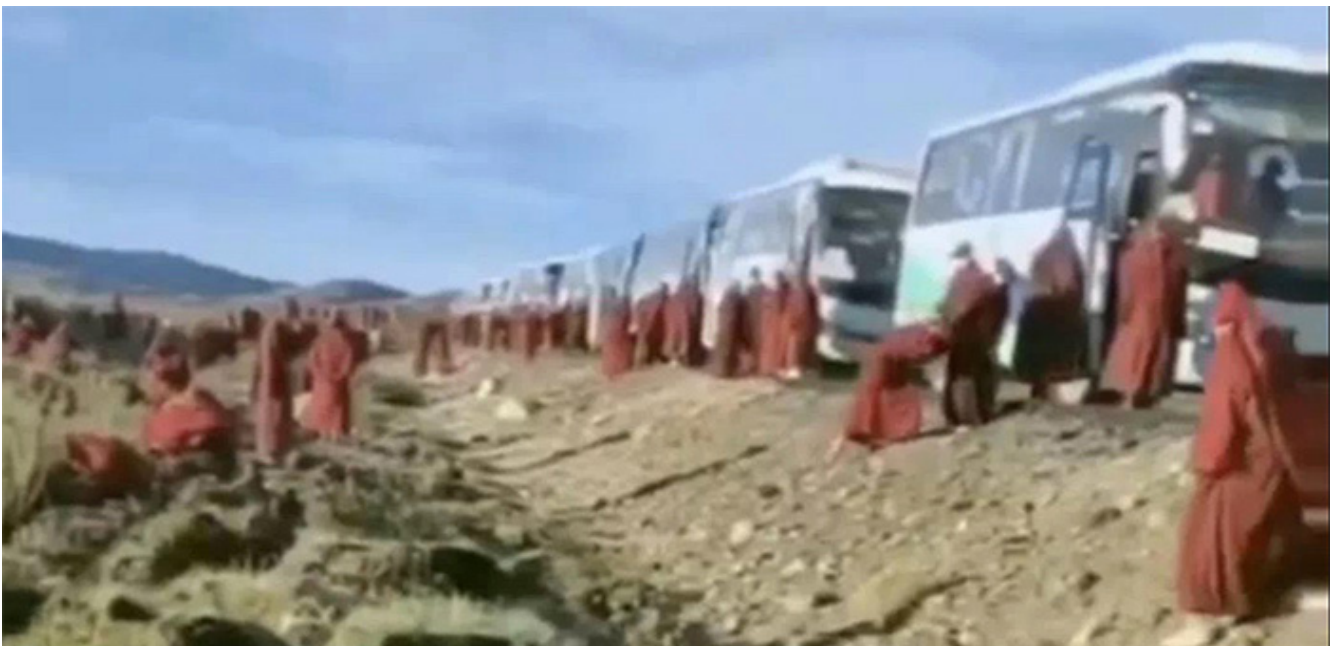
Nuns forced to leave Yachen Gar.