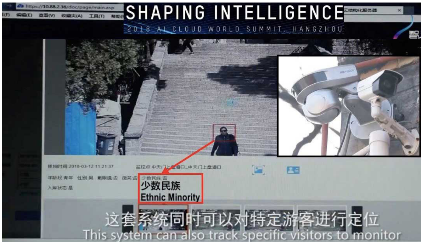
Showcasing Hikvision facial recognition camera capability to identify ethnic minorities.

The active presence of police forces the monastics to constantly ask themselves whether anything they do could be considered illegal. Because China’s laws are chronically vague, it is hard to know when one has crossed the line, until it’s too late. The prevalence of prosecutions for the crime of “picking quarrels and provoking trouble” is high, and many Tibetans have been declared guilty for expressing dissent from the official line.