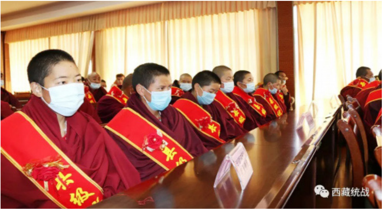
Monks and nuns being “commended” by the Party and United Front Work Department officials in January 2021 in Chonggye (Qiongjie) County, Lhokha (Shannan) City for “complying with four standards and striving to be advanced monks and nuns”.