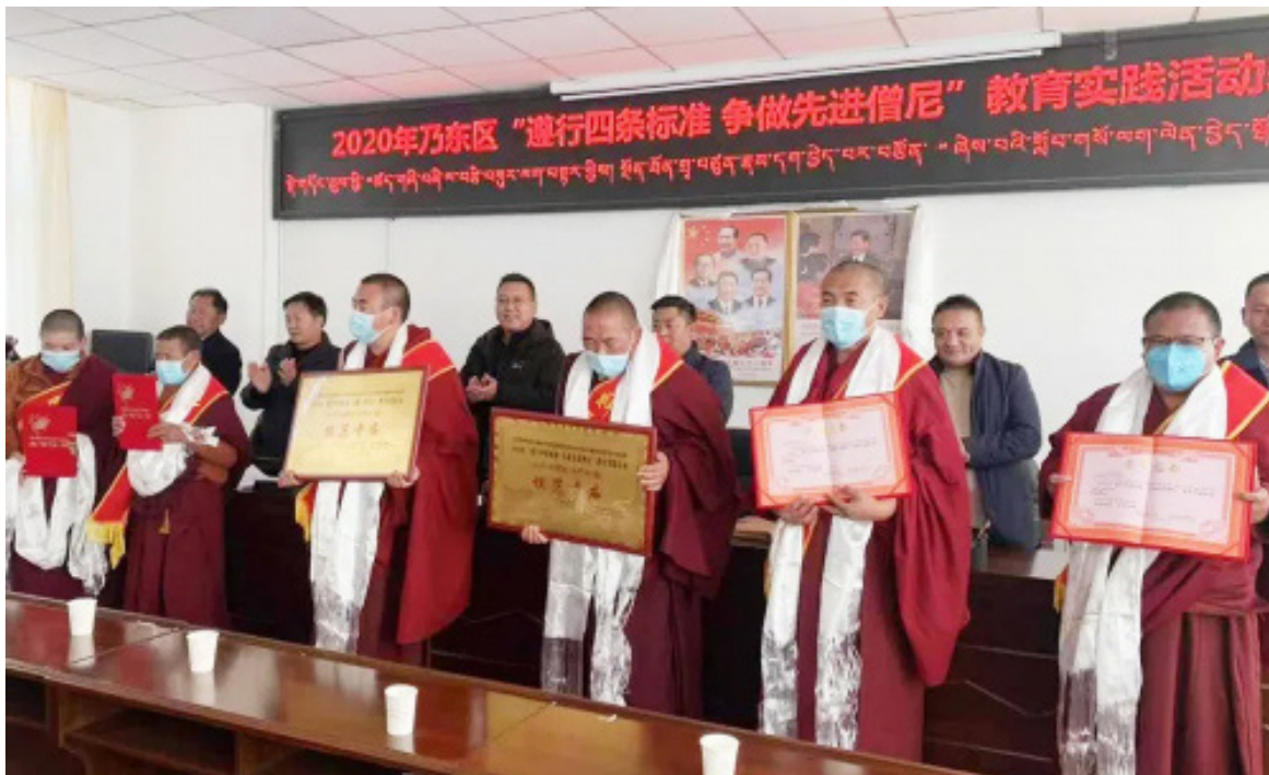
The Party and United Front Work Department hold a work summary and “commendation” ceremony on Jan. 19, 2021, for the conduct of “Complying with the Four Standards for Monks and Nuns” in Nedong (Naidong) District in Lhoka (Shannan).

At the core of control of the Tibetan monastic community is the United Front Work Department (UFWD). This hitherto relatively low-profile department in the Chinese party-state system has been promoted as the de facto policy development and central coordinating body for activities across the party-state agencies. This warrants a brief discussion of the UFWD and its role in Tibet.