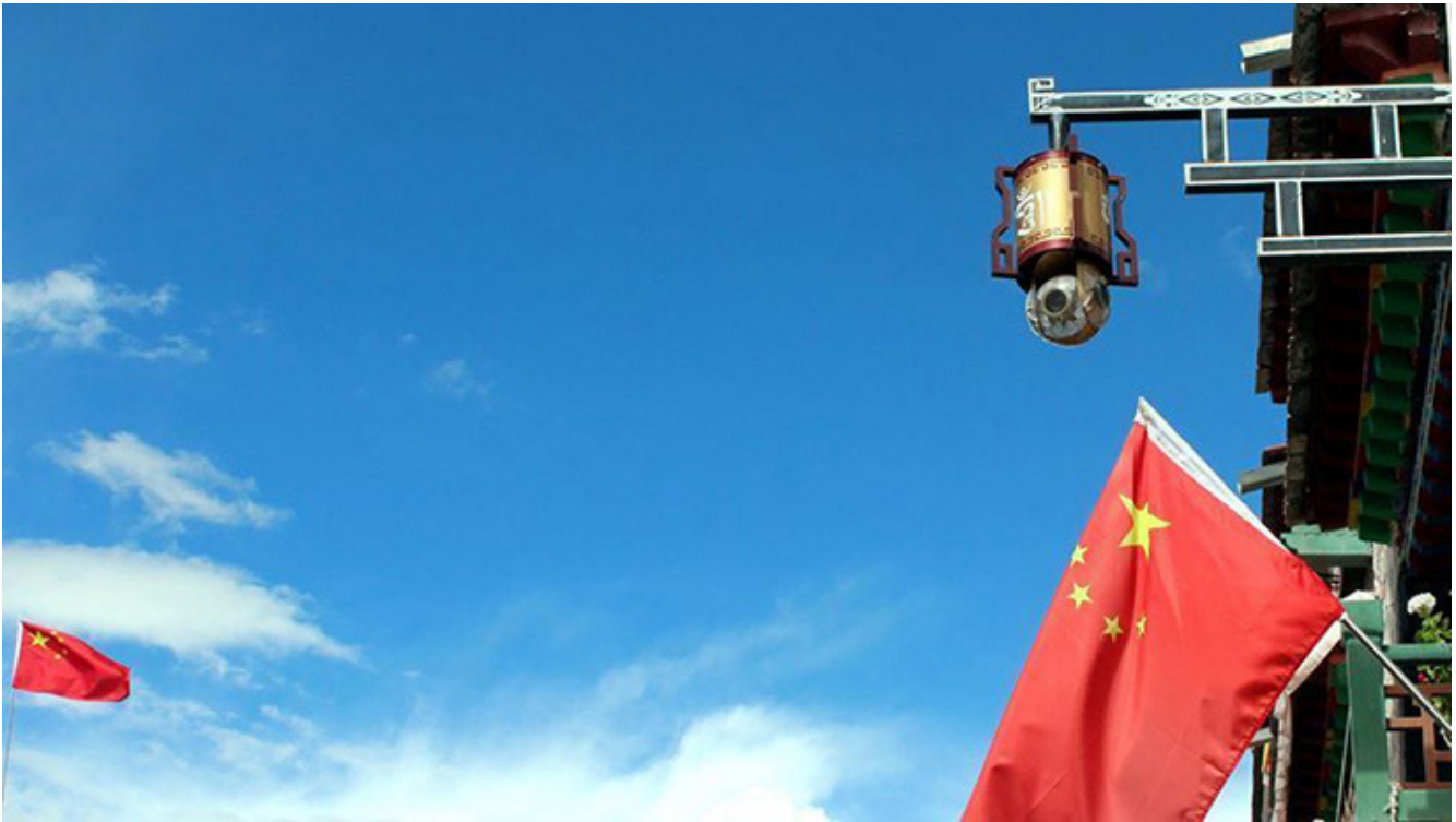
A surveillance camera in Lhasa disguised as a prayer wheel.

Tibetan Buddhist practitioners enjoy the protection of international law. The control and surveillance exerted by the Chinese state over Tibetan Buddhism, and in particular over monastic life, inhibit the rights of Tibetan nuns and monks to freely practice and develop their religious life. As former United Nations Special Rapporteur for Freedom of Religion or Belief Heiner Bielefeldt notes, “freedom of religion or belief does not protect religious traditions per se, but instead facilitates the free search and development of faith-related identities in the broadest sense of the word.” [59] This means that Tibetan Buddhism can only flourish if its traditions, its canons and its rules are learned, transmitted and further developed freely—i.e. free from the intervention of the Chinese state, and particularly free from control and surveillance.