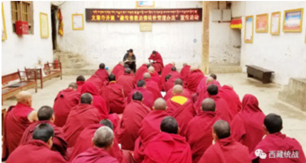
A cadre instructing monks at Yizhang Monastery to abide by the law on reincarnation.