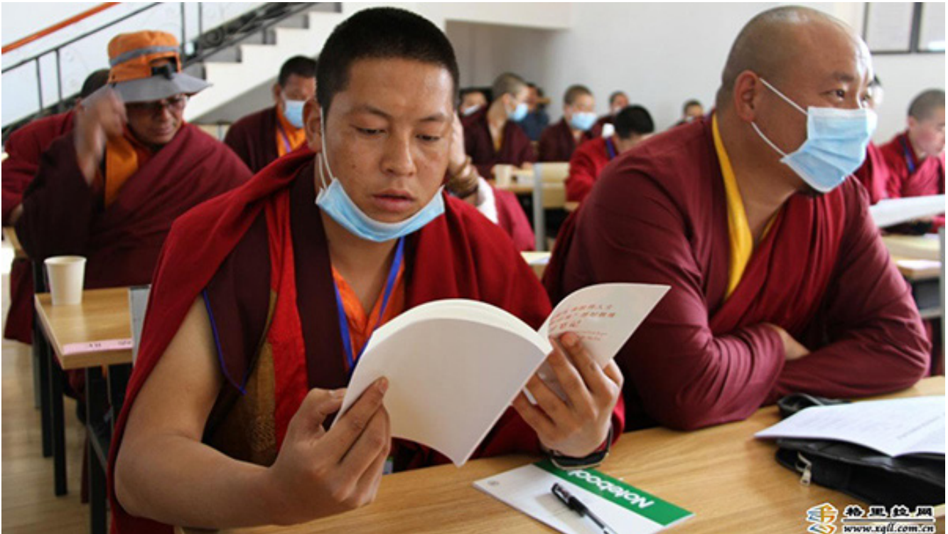
Glimpse of a classroom during the weeklong political training in May 2020 for monastic community in Dechen Prefecture, Yunnan.