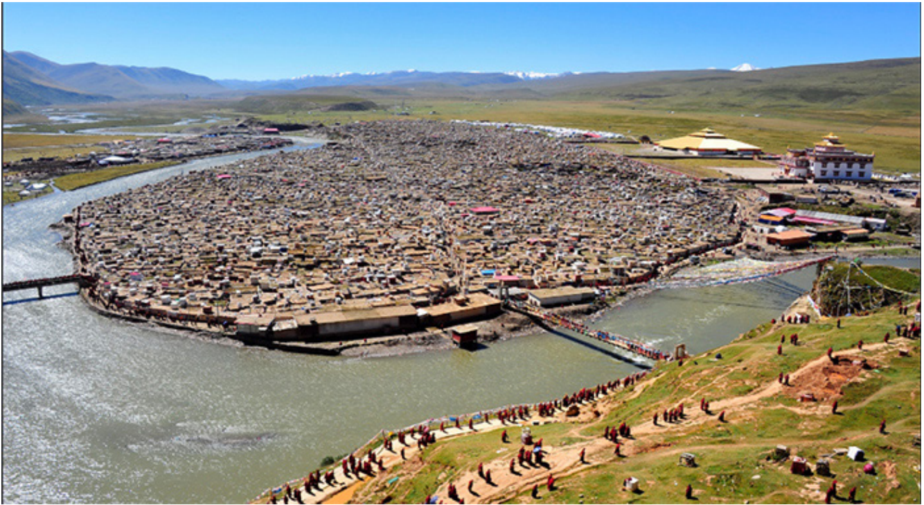
Yachen Gar in 2013 before the destruction.