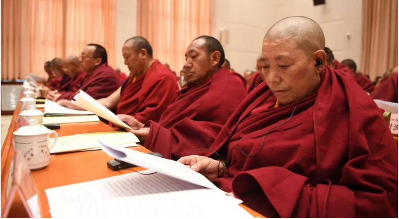
Monks and nuns at the symposium on the “four standards” read handouts issued by Chinese officials.

Although the UFWD always played an important role in Tibet policy in the past, especially since the establishment of its seventh bureau dealing with Tibetan affairs in 2005, this structural change gave an arm of the CCP even more power and significance in overseeing the implementation of the policies in Tibet and in particular controlling the monastic community. This is also confirmed by the tripling of the budget for the UFWD in the TAR in the past five years.