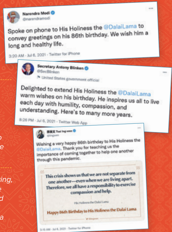
Above