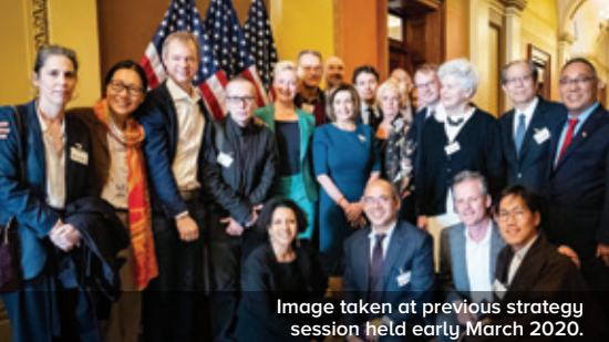
Image taken at previous strategy session held early March 2020.