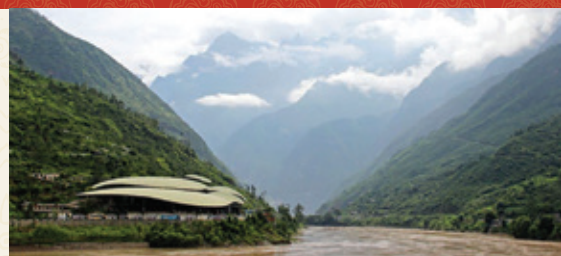
View of the bus park for tourist coaches at Tiger Leaping Gorge.

This repression is particularly alarming given the critical role of Tibetan environmental defenders at a time when temperatures on the Tibetan Plateau are rising at least two times faster than the global average.